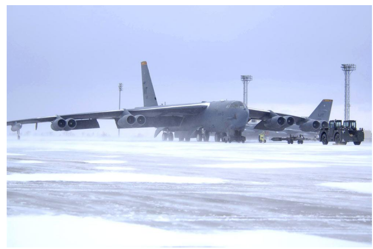
Production ended in 1962, the youngest B-52 is 53 years old.