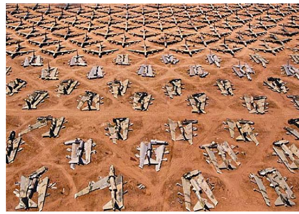
After the Soviet Union fell in 1991, 365 B-52s were destroyed under the START treaty. The aircraft were stripped of usable parts, chopped into 5 pieces with a 13,000 pound steel blade, and sold for scrap at 12 cents per pound.