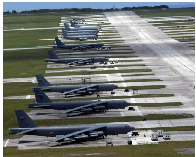
There have been 744 B-52s built, but currently there are only 85 in active service, with 9 in reserve.