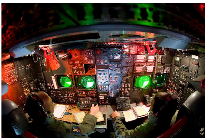
The navigator and radar navigator sit in the lower deck of the aircraft. These are the two seats that eject downward.