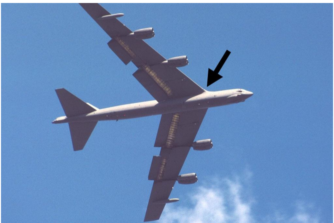
To comply with the SALT II Treaty requirements, cruise missile-capable aircraft had to be identifiable by spy satellites. To comply, the B-52 "G" models were modified with a curved wing root fairing.