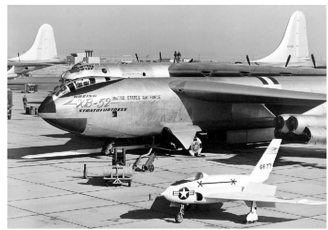
The B-52's first flight was April 15, 1952 - over 63 years ago.