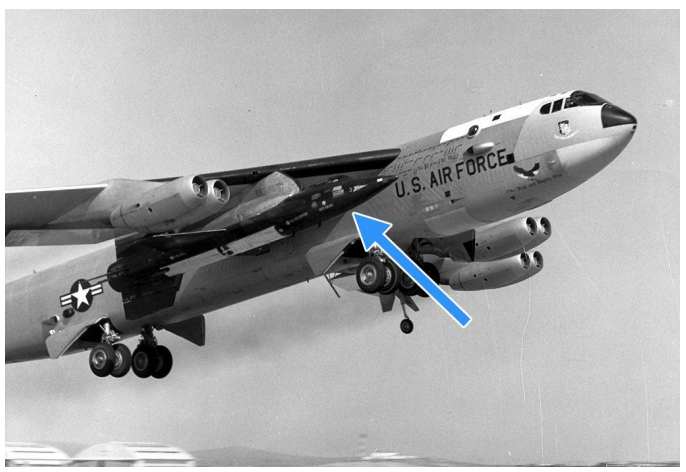
A B-52A was used to carry the North American X-15. The X-15 achieved the record for fastest manned powered aircraft, with a speed of Mach 6.72.