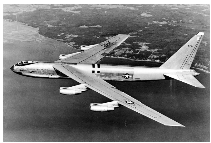
There were huge leaps in aviation happening when the B-52 was being designed, and it went through 6 major redesigns during the 5 year design period. The YB-52 pictured below was the second-to-last major redesign.