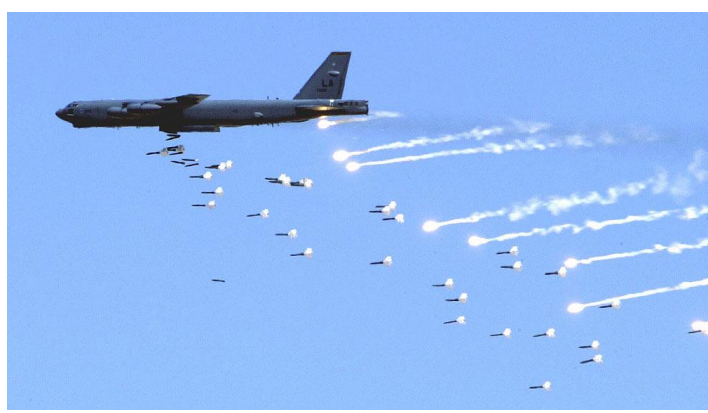
During Operation Desert Storm, B-52s delivered 40% of the weapons dropped from the air.