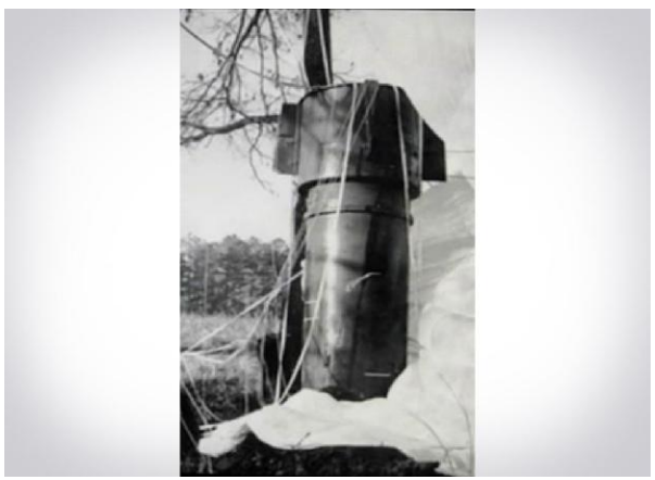
In 1961, a B-52G broke up in midair over Goldsboro, NC. Two nuclear bombs on board were dropped in the process, but didn't detonate. After the bombs were recovered, the Air Force found that five of the six stages of the arming sequence had been completed.