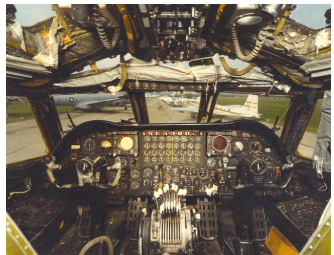
Early models had cabin temperature problems; the upperdeck would get hot, because it was heated by the sun, while the navigation crew would sit on the cold fuselage floor.