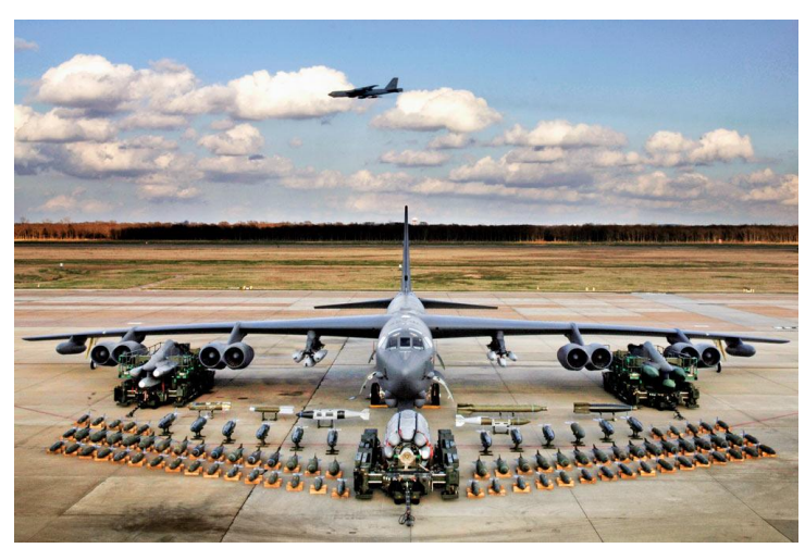
The B-52 can carry up to 70,000 pounds of ordnance, or the equivalent of 30 fully-loaded Cessna 172s.