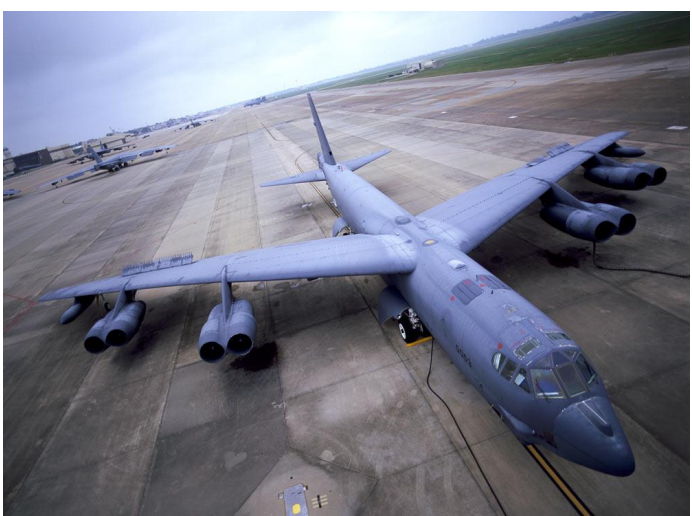
The B-52 is expected to serve until the 2040s. That's over 90 years of service.