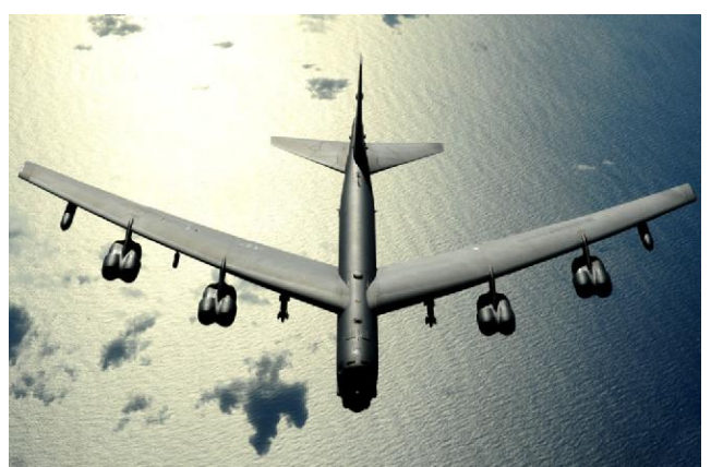
Currently, B-52s cost $70,000 per flight hour to operate. And while they might be ugly, they're still a pretty amazing and adaptable aircraft.