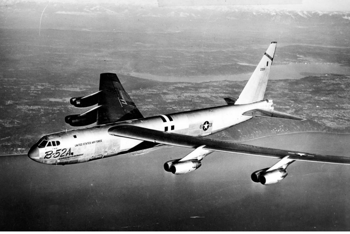
The B-52 was designed to carry nuclear weapons during the Cold War, but it has only conventional ordnance in combat.