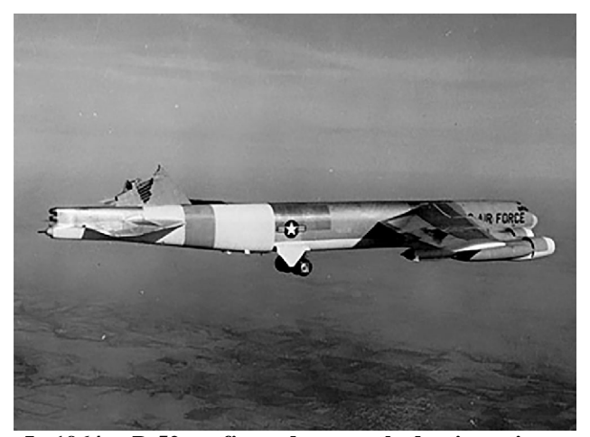
In 1964, a B-52 configured as a testbed to investigate structural failures flew through severe turbulence, shearing off its vertical stabilizer. The aircraft was able to continue flying, and landed safely.