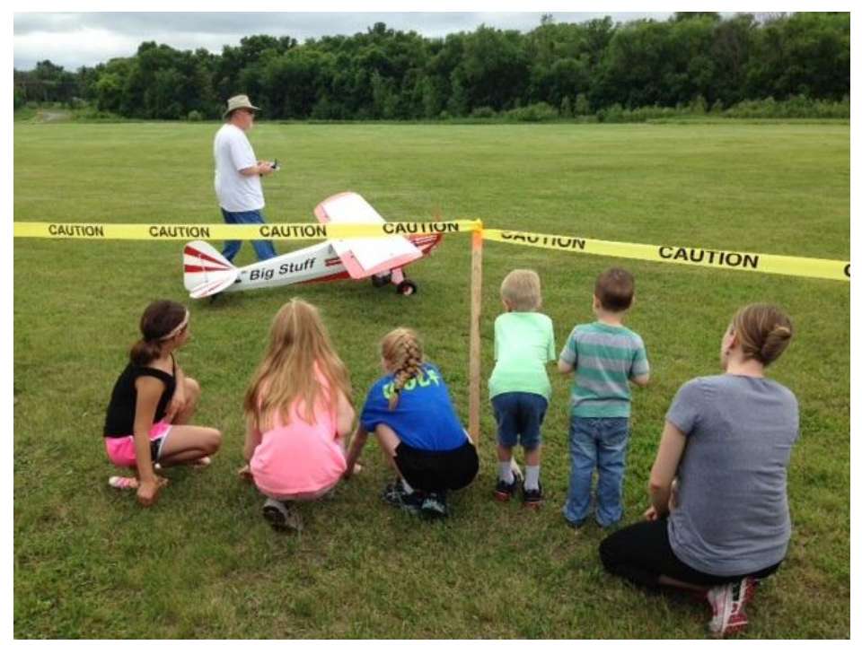
Kids were pretty excited waiting for the plane to take off and make the candy drop at Father Hennepin Days.

The second annual Father Hennepin festival airshow was a great success. The day started out poor and I must admit I was wondering as I drove from Shakopee to Champlin in the mist and rain whether we would have a repeat of last year's bad weather or not. Luckily by 9:15 the rain stopped and the cloud ceiling lifted somewhat. The winds were light and right down the runway and stayed that way pretty much all day.