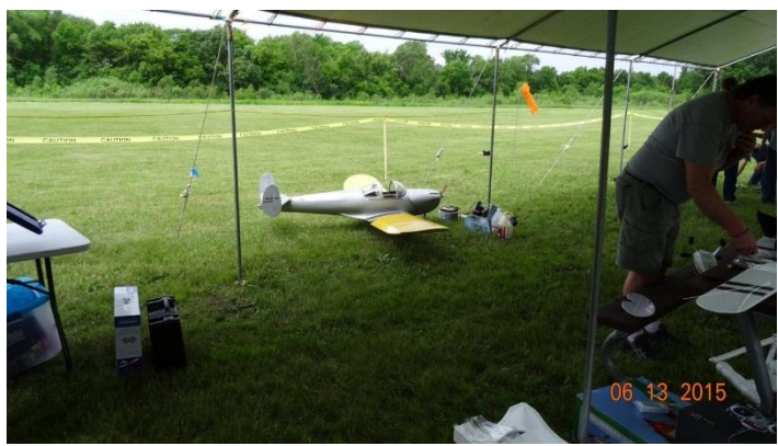
Pete Stapleton's Ercoupe in the pits.