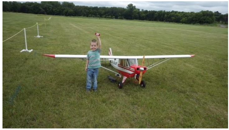
A very satisfied customer stands in front of the R/C plane that made the candy drop during the Father Hennepin Days Air Show put on by TCRC on June 13<sup>th</sup>.