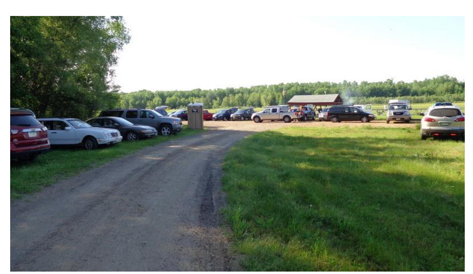
The parking lot was filled to overflowing for the June 'Meeting at the Field'.

The TCRC board of directors decided to move the June, July and August meetings to the Jordan Model Air Park, weather permitting.