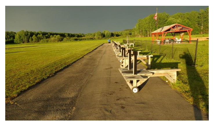
There was still some sunshine left that the pilots did not take advantage of at day's end.

The shelter was looking really nice at the 'Meeting at the Field' after the work done on it in May.