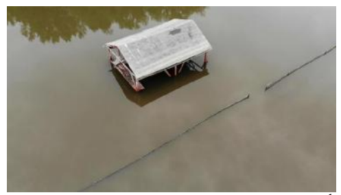
TCRC's shelter shown on June 17<sup>th</sup> with the shelter still having several feet of water in it.

Club member Dick Voeltz has been taking some aerial shots of the field with his drone over the last few weeks, and up until last week we were showing some great progress in reclaiming our flying site.