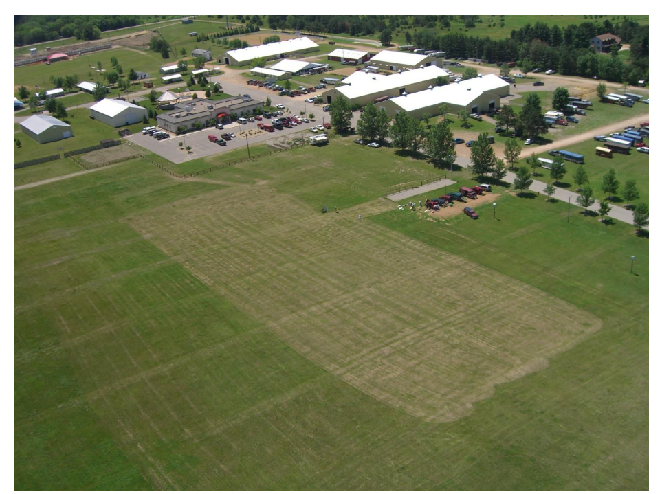
The Fairgrounds flying site as seen from the eye of a Slow Stick.

Due to the flooding over the past month, the Scott County Fairgrounds was our flying site for 50 days. There are a few changes that you should be aware of related to our use of the fairgrounds field: