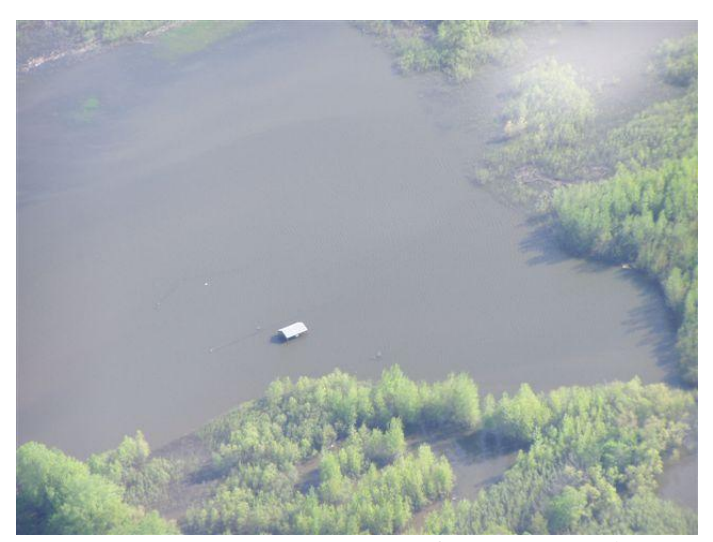
The shelter and the spectator fence sadly stick out of the flood water that covered the field this spring.

The field started to flood way back on March 31st, and has been under water ever since. Fortunately, we've had the use of the Scott County Fairgrounds as an alternate flying site while we waited for the water to recede. At the flood crest the water rose to over 26 feet, which covered the lower shingles on the shelter roof. That's the equivalent of over 8 feet of water on the field. The water receded almost to below the flood level at the end of April, but additional rain caused another surge that didn't fully drain away until May 23rd. The eight-plus weeks of flooding must be close to a record! (Editor's Note: Actually, 1993 seemed to last forever!) Hopefully, the damp conditions are behind us, and we can look forward to great flying conditions for the rest of the year.