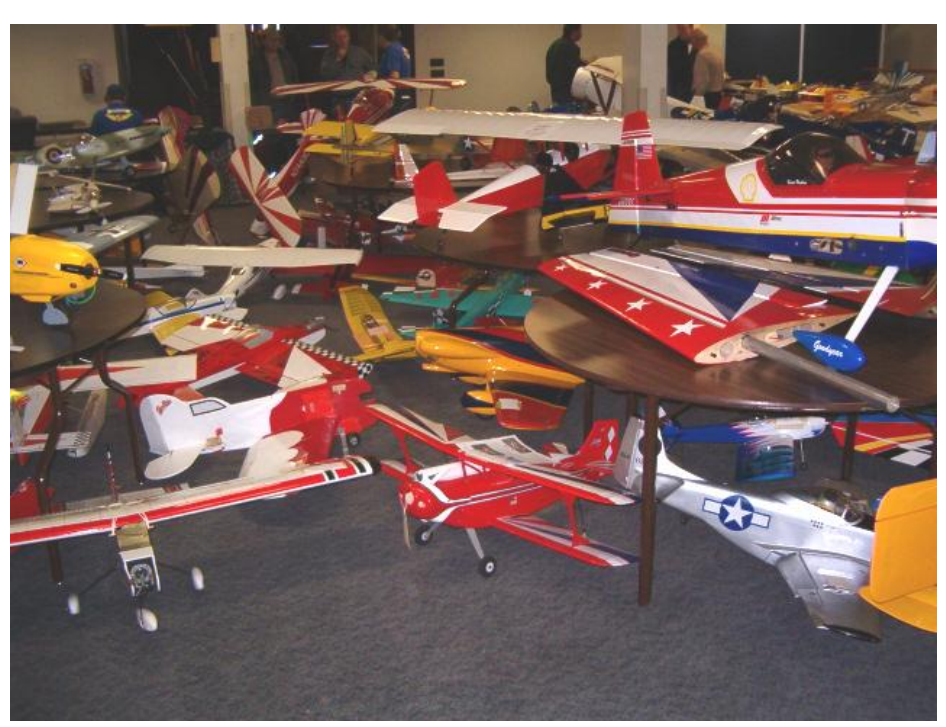
As usual, the impound area was filled to overflowing with lots of great airplanes.