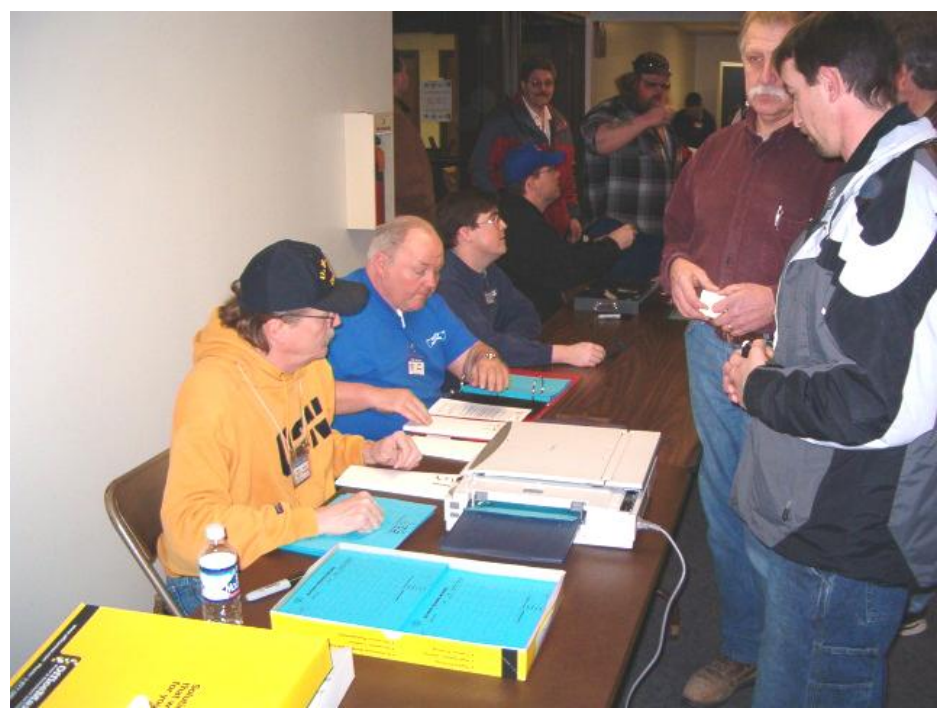
The bidder registration crew had no problem getting the 248 bidders their cards and auction rules.