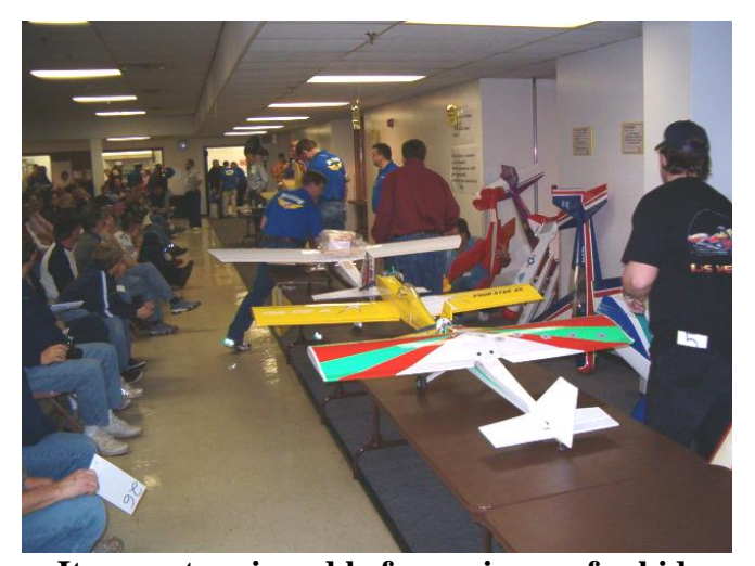
Items got reviewed before going up for bid.