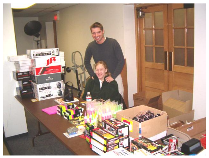
Hobby Warehouse kept busy at the auction.