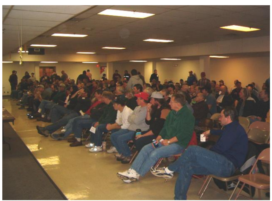
The bidders and sellers had a great view of the auction action.