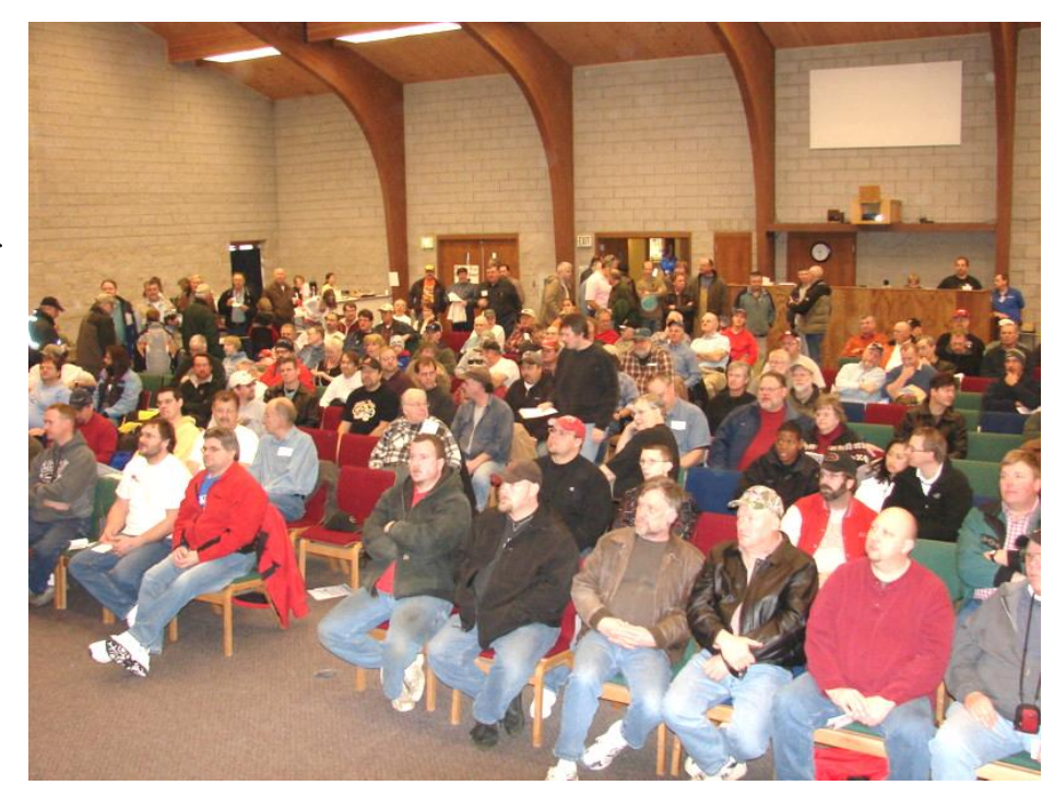
This is less than half of the crowd that watched the auction action on February 7<sup>th</sup>.