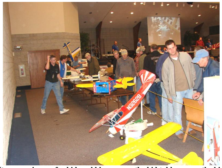
Items coming up for bid could be seen on the bid tables, or on the big screen on the stage.