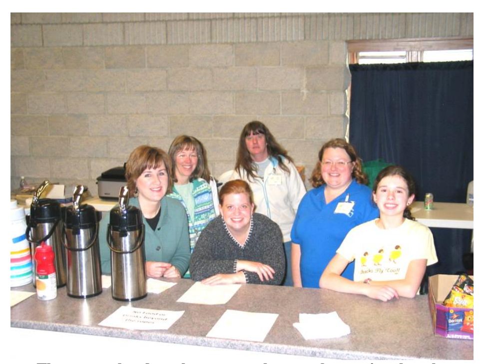
There were hard workers everywhere at the auction, but the prettiest faces were in the concession area.