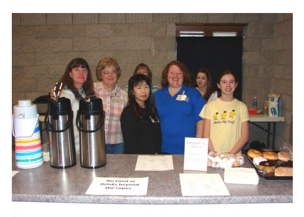
The concession crew kept everyone well fed at the auction.