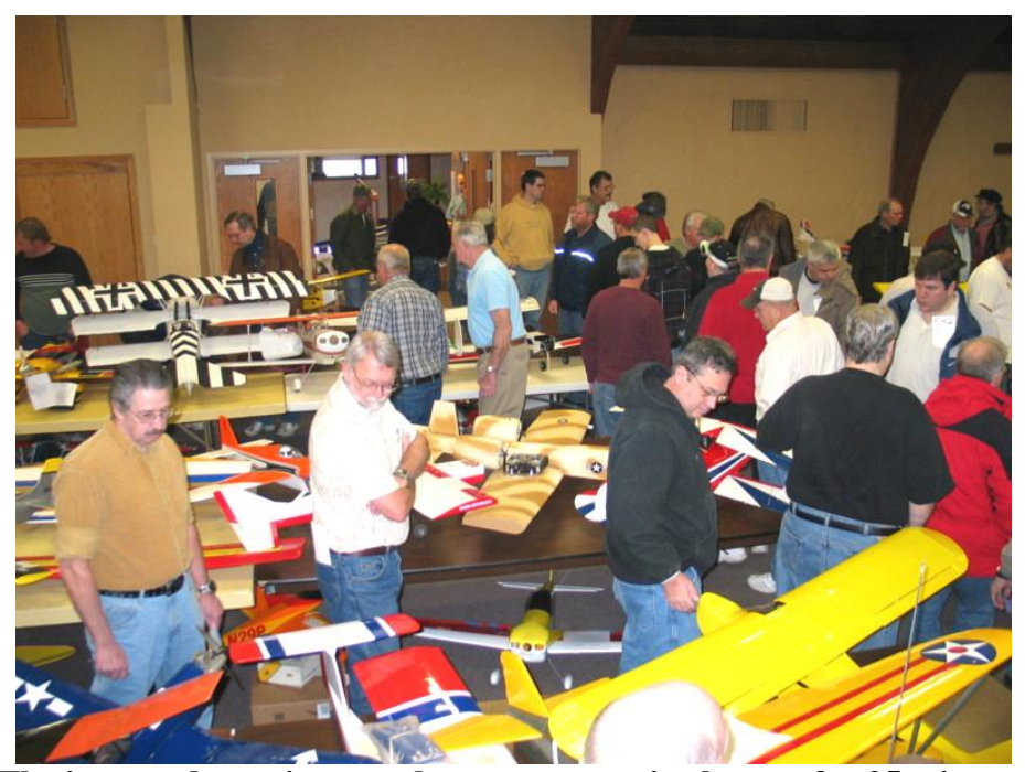
The impound area is opened up to prospective buyers for 25 minutes prior to the start of the auction.