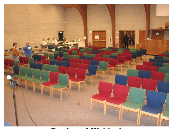
Ready and Waiting!