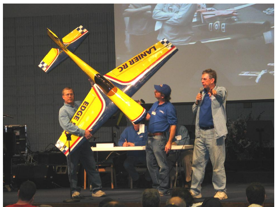
A beautiful Edge 540 goes on the auction block at TCRC 33rd Annual Auction.

This year the auction was held at a new location and we were able to set up for the auction on Friday night (a BIG THANKS to Cross Point for Saturday, February 6<sup>th</sup>, 2010 ©