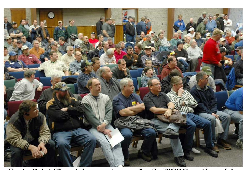
CenterPoint Church is a great venue for the TCRC auction, giving all of the bidders comfortable seats and a good view of the action.