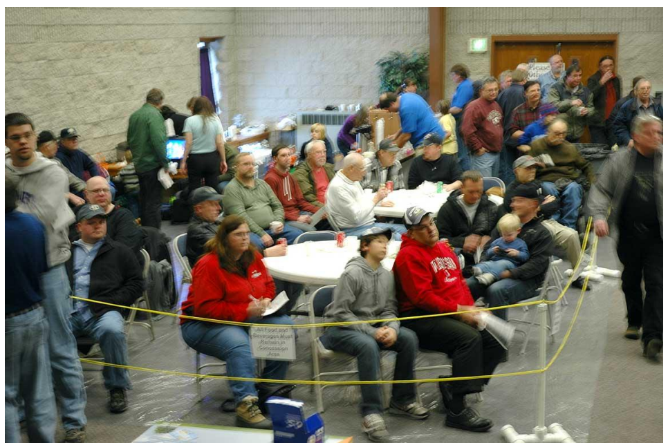
Auction will be held at CrossPoint Hungry bidders could munch and keep track of the auction action at the same time.