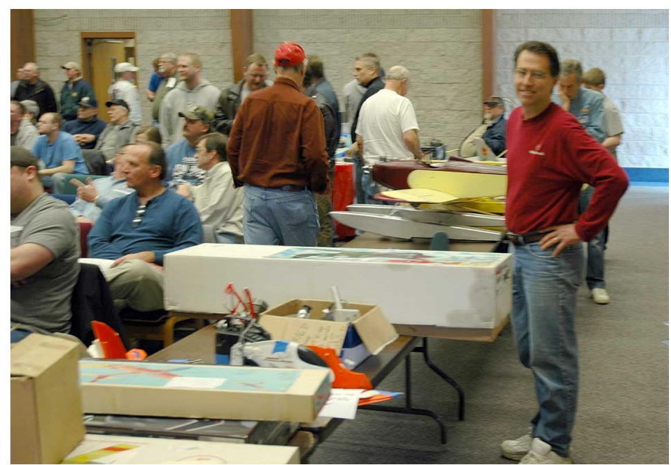
Potential bidders had a good chance to take a nice close look at the items as they approached the stage.