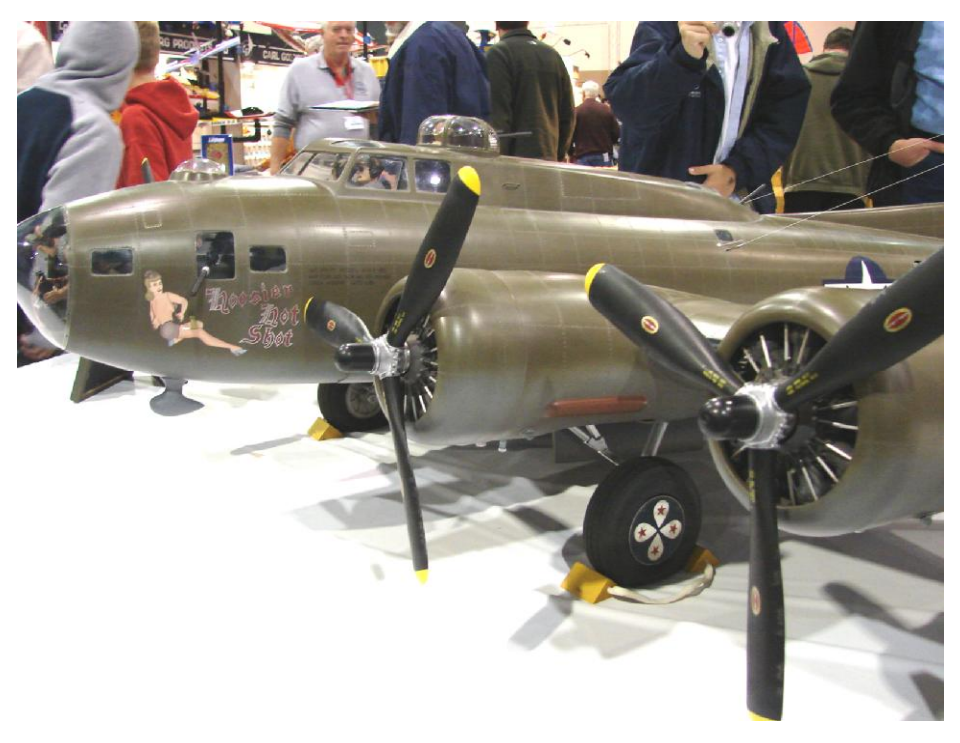
The models entered in the scale categories were favorites of those at the Expo. This bomber was gorgeous.