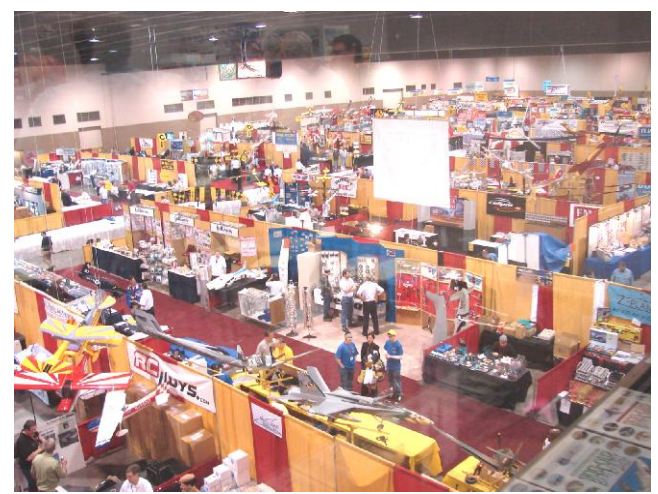
The main floor of the Toledo Expo just moments before the doors opened.