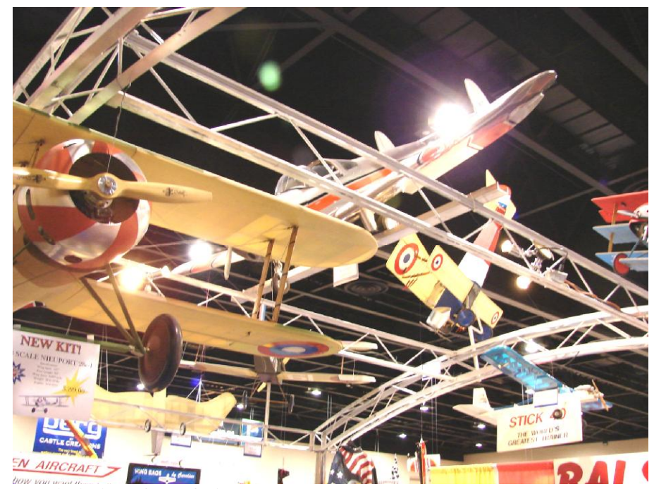
The air is just full of airplanes, everywhere you look at Toledo Expo.

There is nothing bigger or better in our hobby of R/C aircraft then the Toledo Expo, sponsored by the Weak Signals R/C Club of Ohio.