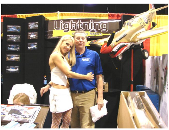
The Skyshark booth seemed to be quite an attraction at Toledo Expo.