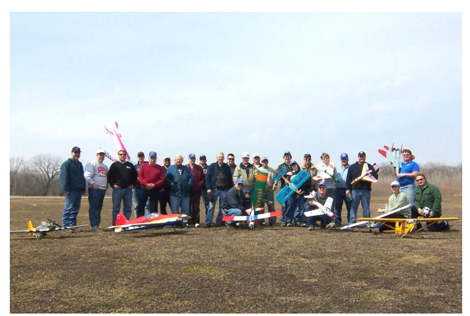
A shot of the many pilots and spectators that came out for the April Fool Fun Fly.

As scheduled the April Fools' Fun Fly weather was almost perfect. has scheduled for this summer look The temperature was around 60 and winds were quite mild. The only like they may be as exciting as problem was with the parking lot, or to be more precise, going past the combat flying was when it was edges of the parking lot. There, it was very soft and muddy, as several members found out. Thanks to those who helped push.