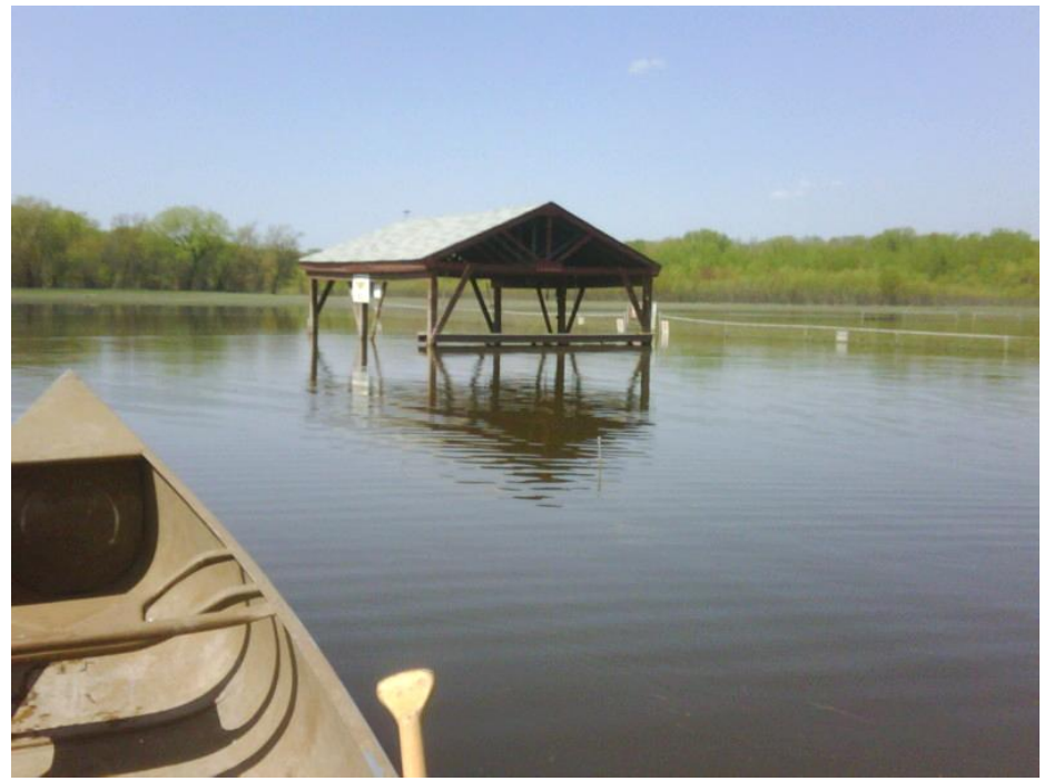
A picture of the shelter at the TCRC field taken by Curtis Beaumont as the water receded. He did some float flying at the field before the water was completely gone.

TCRC field was hit hard this year by an almost record high river crest near 32 feet. The water level is now below 18 feet. and the field is starting to dry off. We need to move field cleanup to May 15<sup>th</sup> to allow for the field and parking lot to dry. After water this high we may have a few surprises (logs) deposited on the field. We will want to be careful when we remove them so we don't scar the field.