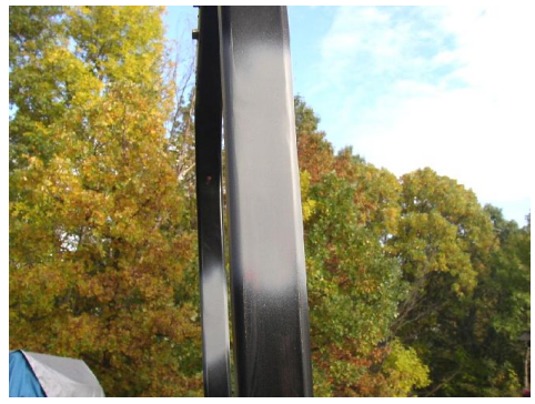
The cuts on the shortened roll bar were undetectable on the finished product.

modified roll bar would be at least as strong, if not stronger, than the original set up, and to finish the project so that the modification could not be easily detected. As the included photos show, both goals were exceeded. However, what started as an hour-long job eventually turned into a five-hour project.