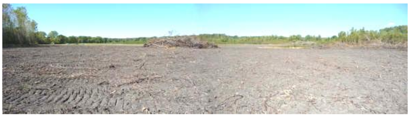
The approach to the runways from the east is much easier now because of the removal of the trees and brush.

Those TCRC members attending the Season Finale in October were able to see the huge amount of tree and brush clearing that the club has undertaken to the east of the runways. This area has always been a problem for tree and brush because the runways were very close to that side of our property. However, with the trading of our northern land for the land to the east, the club was finally able to address the tree problem.