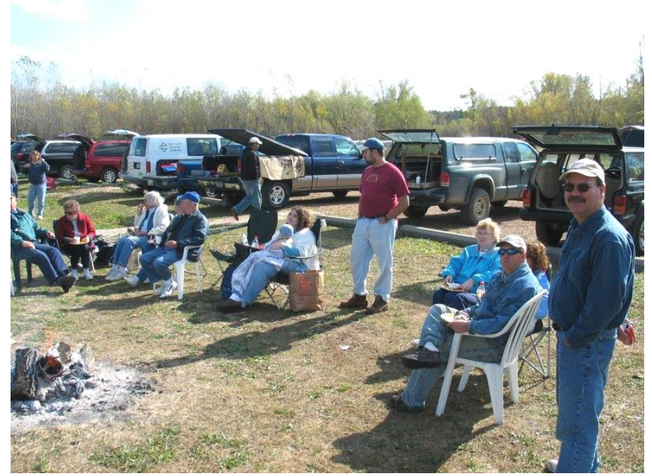
A lot of the people at the Season Finale gathered around the bonfire.

The morning of Saturday, October 18, 2008 opened bright and sunny, and we had a nice group turn out for this last official event of the TCRC summer flying season, the Annual Season Finale. Unfortunately there was wind in the forecast, but we didn't let that keep us from having a bit of fun anyway. Fortunately the wind didn't get too bad until mid-day so many of us got at least a little flying in. By early afternoon the wind was gusting out of the south at between 15 and 20 miles per hour which made flying, and especially landing, a bit of a challenge.