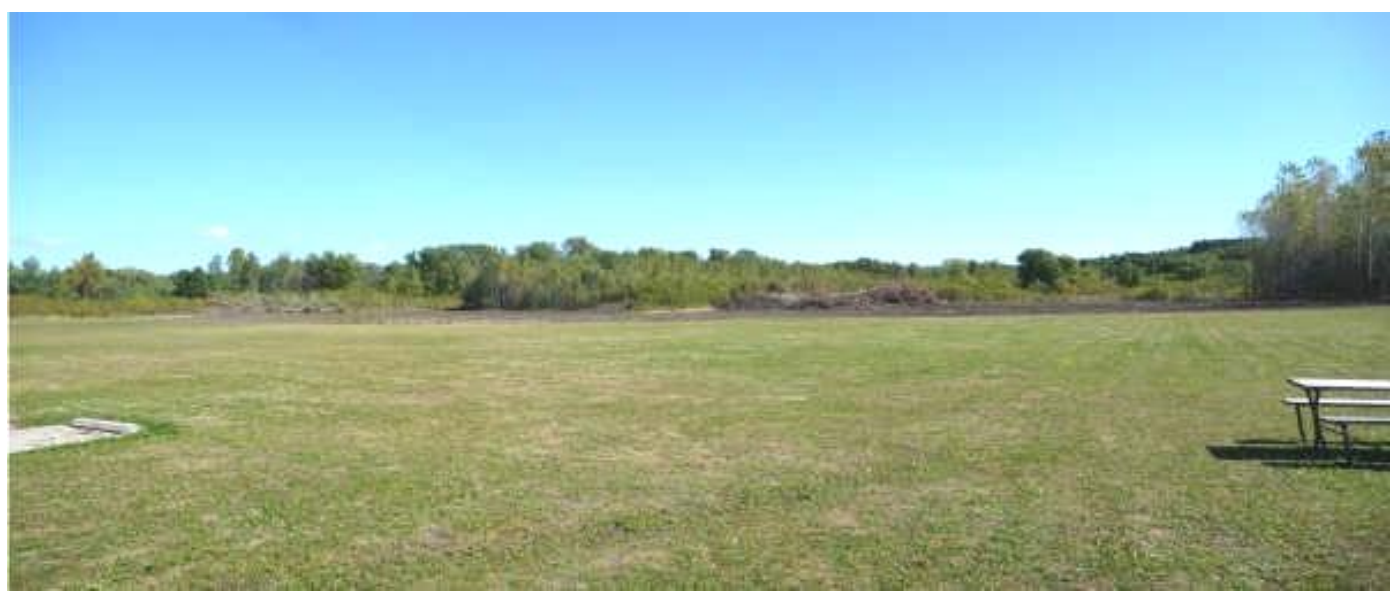
The view from the runways looking east to the area where the tree and brush clearing has been done.