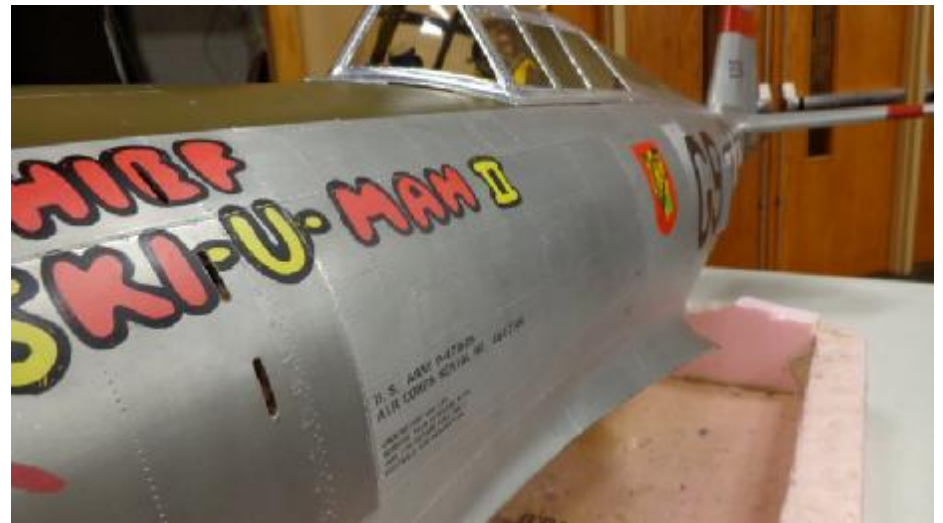
One of the things that made the A close up view of the Flite Metal finish on Nathan O'Connor's P-47. The aluminum appearance was great and of course Chris' scale detailing of the metal was icing on the cake.