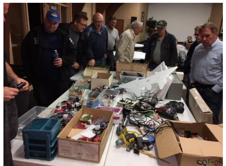
Boxes and boxes of R/C equipment were free to the members at the TCRC meeting.

More airplanes and R/C accessories were given to TCRC members at the October 10^{th} meeting.