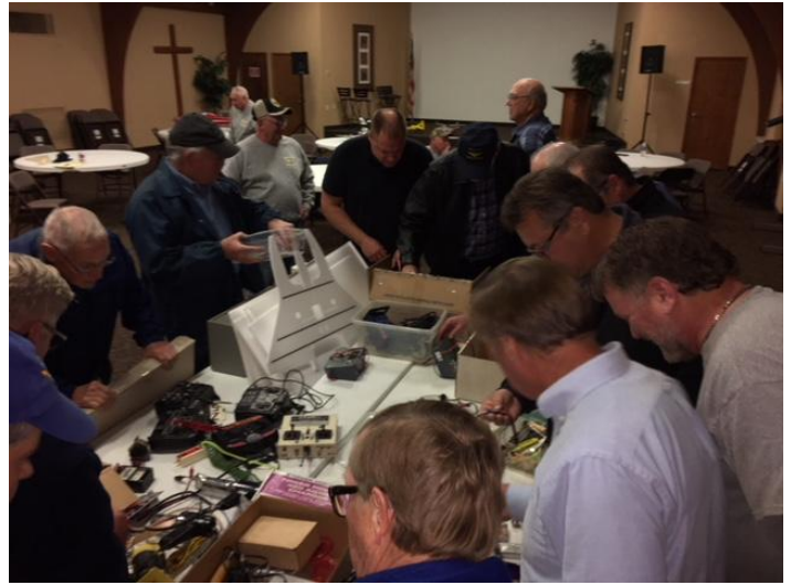
Every member was able to find an item or two that could be used in his R/C shop.

By the end of the meeting, the tables had been picked pretty clean as each member headed home with his great find.