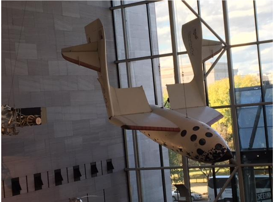
A highlight for me was to see SpaceShip One, the air-launched, rocket-powered aircraft with suborbital flight capacity, shown in its reentry configuration. Designed by Burt Rutan.