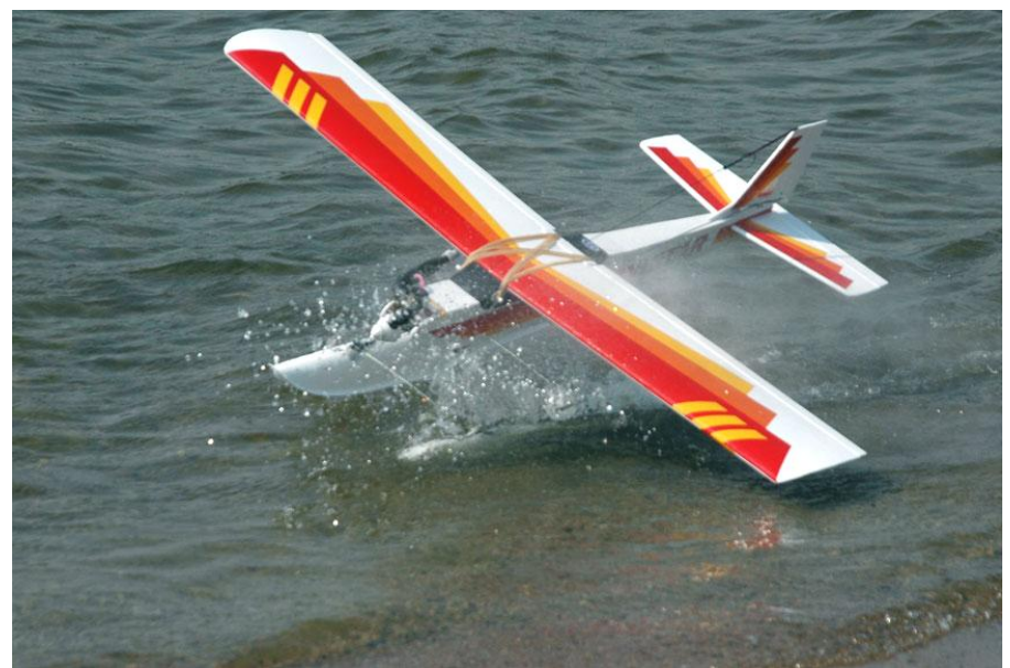
The strong wind catches the wing of Jeff Diesch's trainer after a nice landing.

Well, we had our Fall Float Fly at Bush Lake Park on Saturday, everyone to give some thought to September 10<sup>th</sup>. It was pretty windy but that didn't stop the pilots from running for an office this year. The showing up and certainly didn't keep the planes out of the air. For all the club is growing, we have a great wind, there were no mishaps and everyone had a great time. The Grim field, and we need to get more of our Reaper was there chanting for planes to crash but the gods of flight were members involved in the operation there also and no planes perished in the water. Lots of members came of the club. Please think about down to watch and lend a hand. Thanks to Jim Cook and Mike running for an office this year. Timmerman for chairing the event.