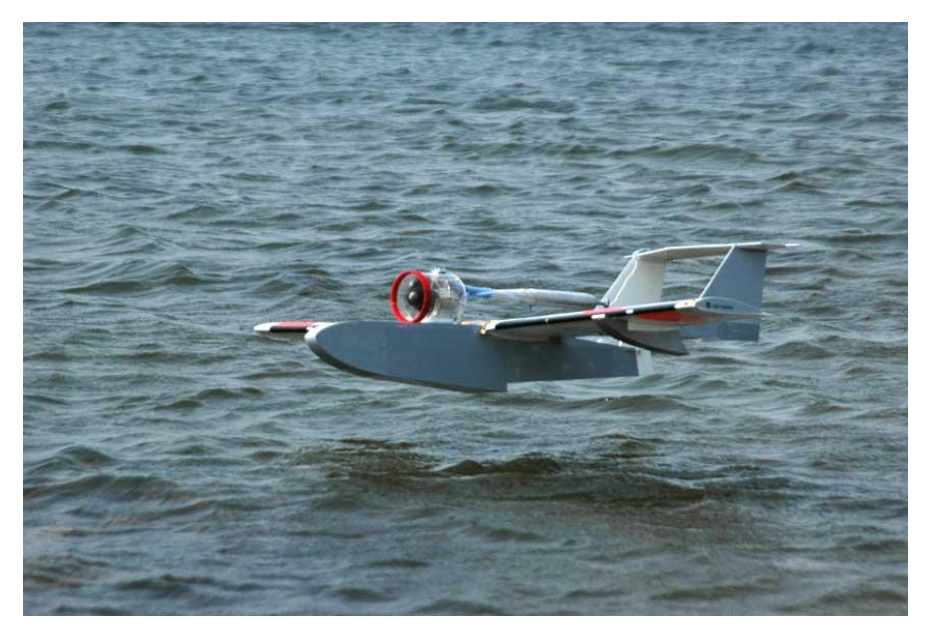
Dan Stensby's SeaFan comes in for a very smooth landing at the TCRC Fall Float Fly.

The weatherman predicted bright sunshine, warm temperatures and winds from 20 to 30 mph for Saturday, September 10^{th} – the day set for TCRC's Fall Float Fly. Unfortunately, the weatherman was right about the winds as they gusted to 35 mph. But the intrepid TCRC pilots were undaunted and started showing up at Bush Lake Park in Bloomington, MN around 10:45 AM.