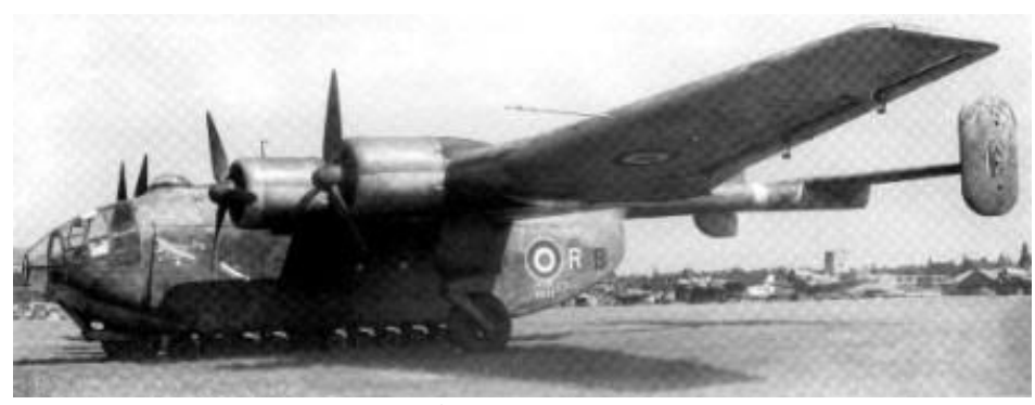
Arado 232 B

Strangely, the plane featured twin engines, two BMW 1,600 horsepower engines, but the insatiable demand for these engines for the Focke-Wulf 190 fighter required a redesign, and four BMW 323 engines were fitted. This was a major redesign, and added 5 feet, seven inches increase to the center section.