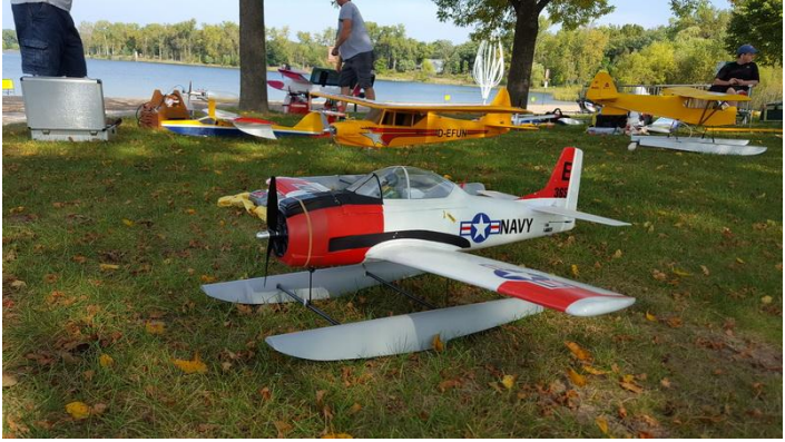
This Hellcat really looked great both in the pits and in the air at the Fall Float Fly at Bush Lake Park in Bloomington.