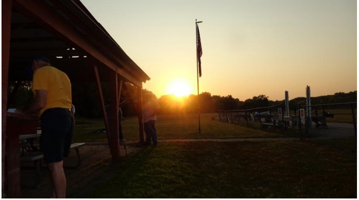
It was very noticeable that the sun was setting pretty early now, leaving very little time to fly after the business meeting.