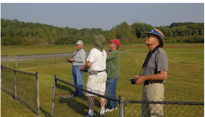
The flight line was a busy place at the September MATF. Sunshine and no wind were very helpful.