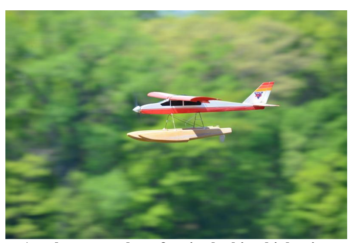
Another great shot of a nice looking high-wing trainer coming in for a nice landing.