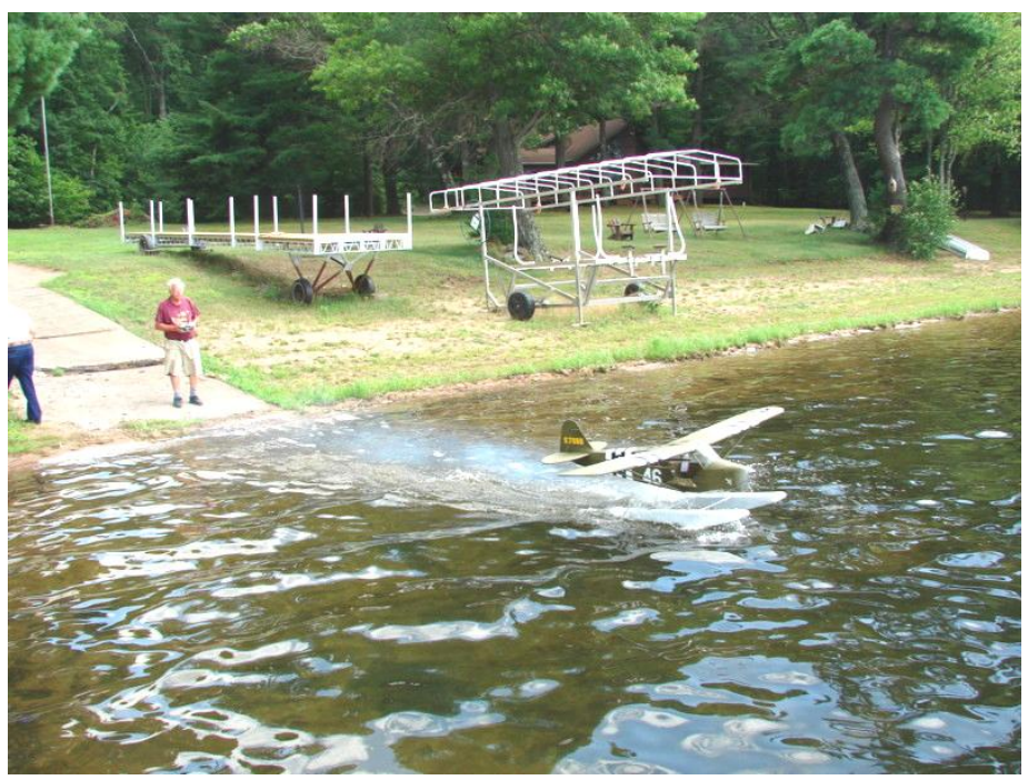
Stan Erickson's L-4 takes another flight over Viola Lake.