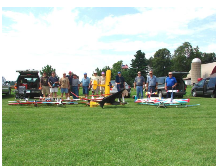
The Wisconsin Fun Fly pilots pose with about a third of the planes that flew on Saturday in Birchwood.