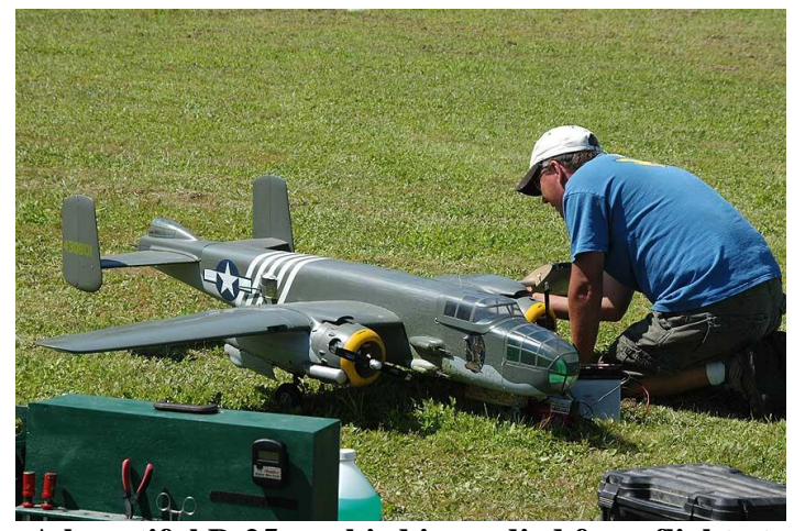
A beautiful B-25 warbird is readied for a flight at the 2010 MAD.