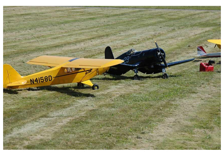
A giant-scale J-3 Cub and F4U Corsair were only two of the big birds that flew at MAD.