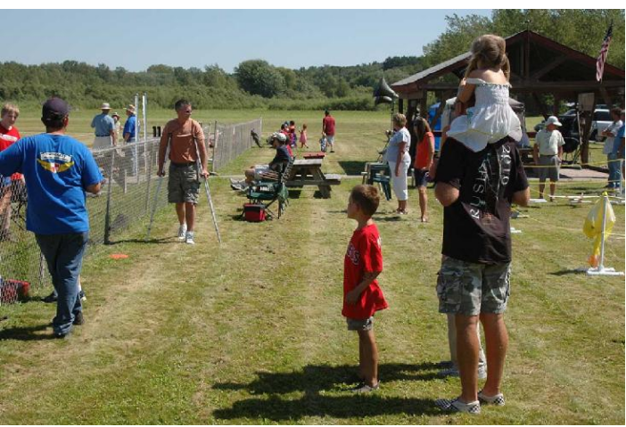
Spectators enjoyed the action in the pits and in the air on a great day for MAD.