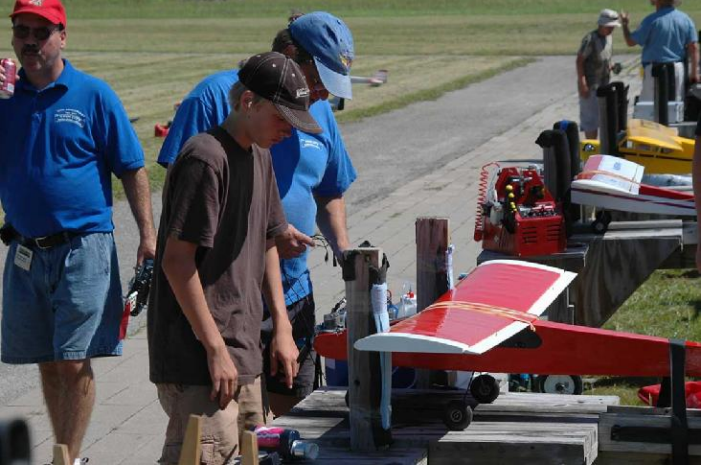
Activity in the pits was constant as planes were in the air all day at MAD.