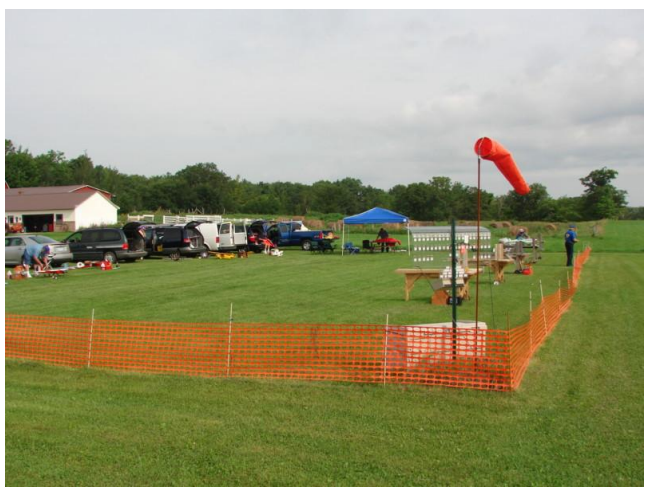
Larry Couture was the first pilot on the flight line at the Birchwood portion of the Fun Fly.