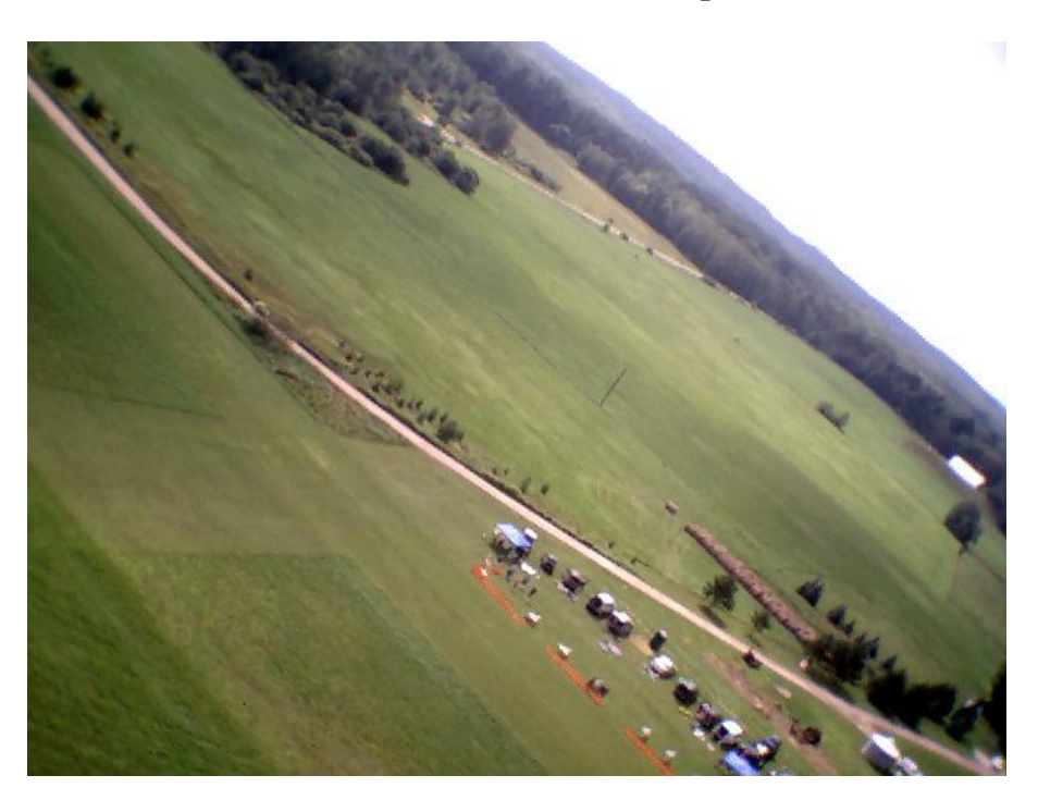
Aerial view of the south side of the Birchwood flying site.