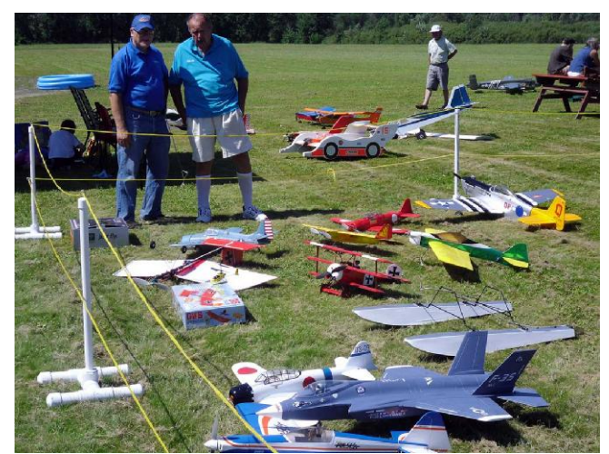
The static display area had lots of neat aircraft from all parts of our hobby.