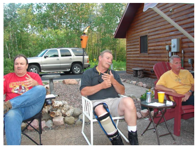
Some of the Rice Lake pilots at the Sachs' house.