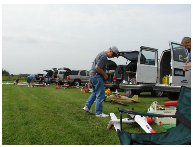
The pits were packed with cars and airplanes at the Birchwood field.