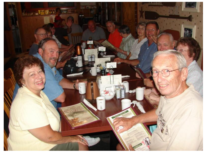
The morning started with breakfast in Birchwood.