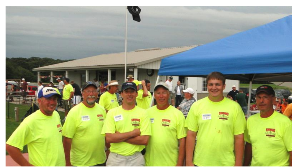
SMMAC members at the Northern Alliance Military Fly-In.

The start of the fall flying season is the TCRC Fall Float Fly held at event of the summer was "Model Bush Lake in Bloomington. This year the float fly will be held on Aviation Day 2010" held on the last Saturday September 18<sup>th</sup> starting at 10:00am. The float fly is open to weekend of the month and any RC pilot with an AMA membership. Spectators are also welcome. If your float plane only comes out for these events you need to give it a wind was a little gusty but I was able good preflight check over. I lost my float plane to a battery failure at the Spring Float Fly.