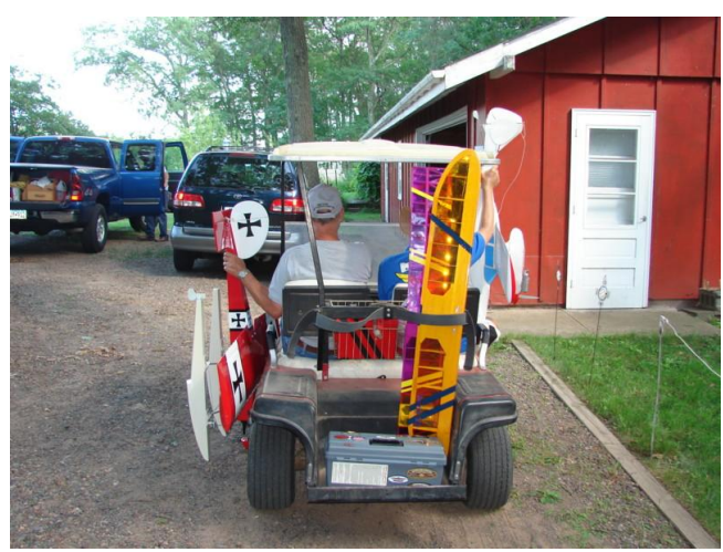
Getting the planes to and from the lake was pretty easy with the golf carts.