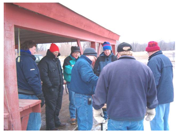
The heat and the aroma of hotdogs being cooked on the grill attracts a crowd at the TCRC Winter Fun Fly.