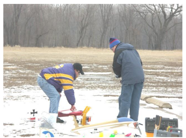
There was some snow to be seen at the TCRC Winter Fun Fly, but not a lot.