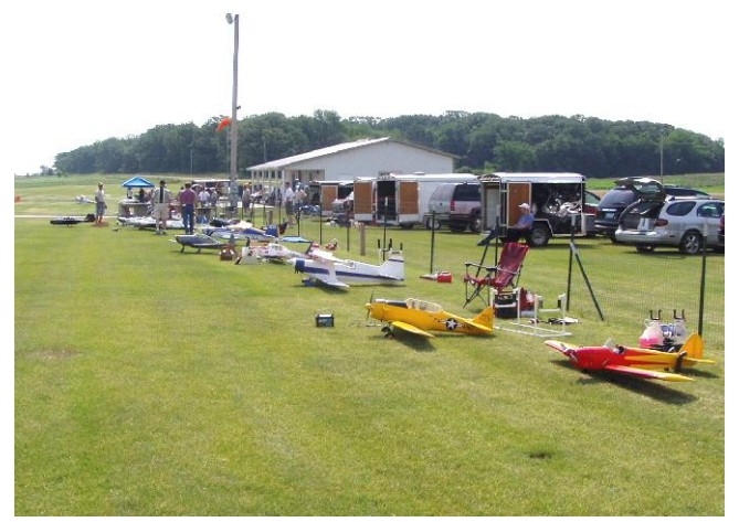
The flight line at Owatonna had lots of nice planes.