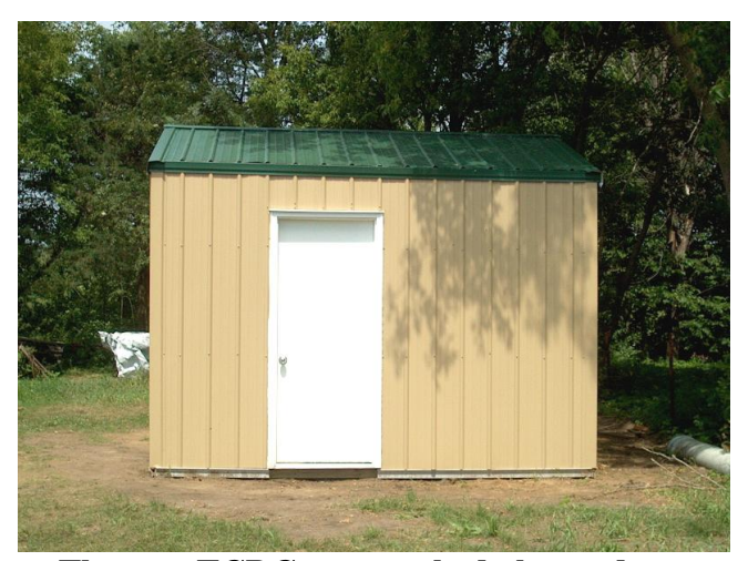
The new TCRC tractor shed almost done.