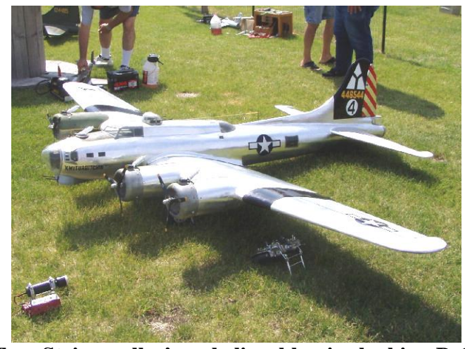
Tom Steinmueller's unbelievably nice looking B-17 sitting in the pits at Owatonna.