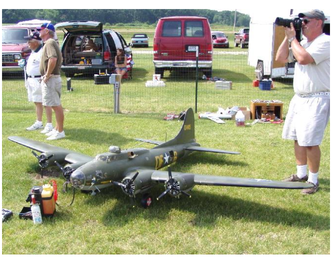
Cal Brandt's B-17 was powered by 4 OS 91 fourstroke engines.