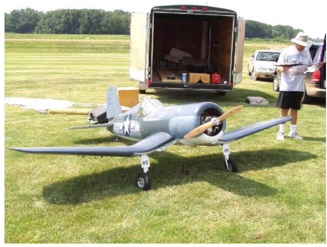
Jeff Quesenberry's beautiful 1/3-scale F4U Corsair was quite a machine.