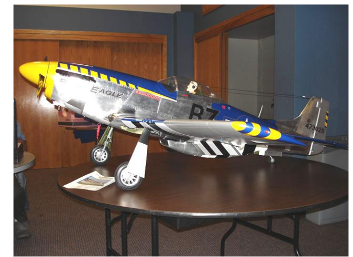
Chris O'Connor's beautiful Top Flite P-51.

The next plane presented was an ARF P-38 which was also one of Larry's. This was an E-Flite electric and was powered with two 960 kv motors and had a 35 amp ESC. It had a wingspan of 42 inches and weighed in at just over 3 pounds. This warbird also has yet to fly and Larry suspects that it won't fly until the spring.