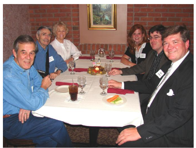
When are they going to serve dinner?