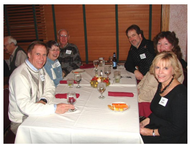
Another happy table at the banquet.