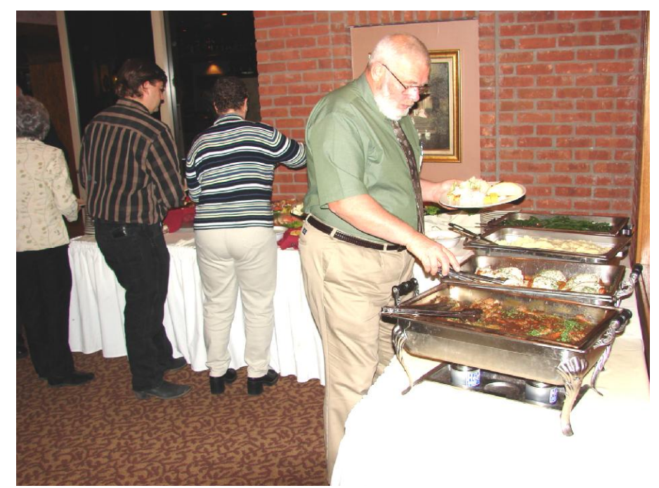
The buffet at Dangerfield's was better than ever and enjoyed by all who were present at the TCRC Banquet.

Sunday, November 18, 2007 found almost 50 TCRC members and spouses at Dangerfield's Restaurant for TCRC's gala banquet.