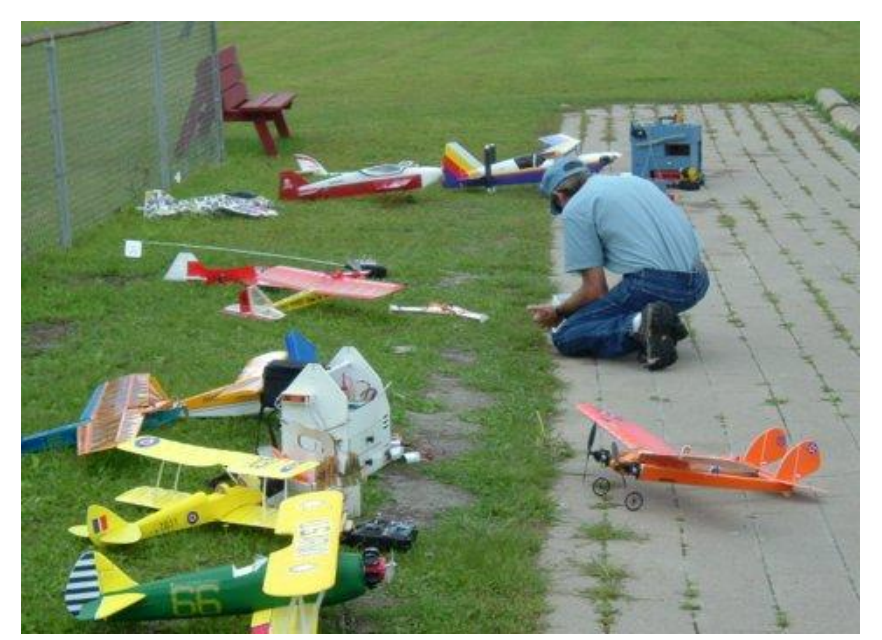
Some of the nice electric planes at the TCRC Electric Fly.