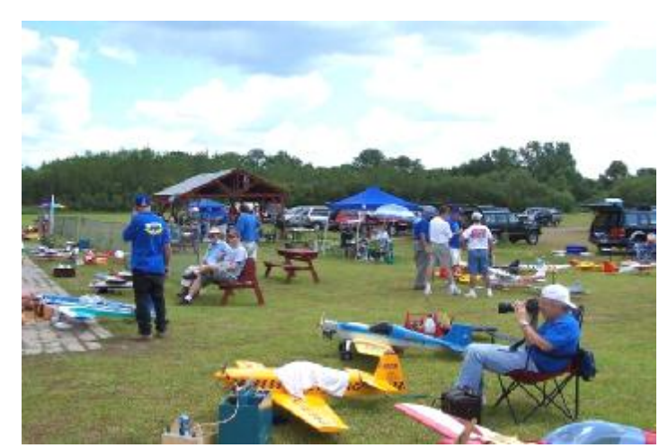
A view of the static display area at TCRC's Model Aviation Day on August 14<sup>th</sup>.