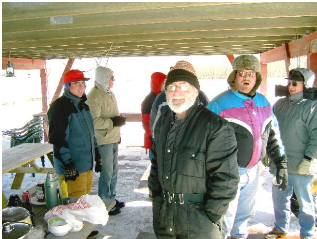
The shelter was a popular place at the Fun Fly.