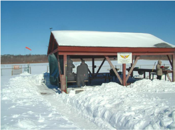
The shelter was surrounded by knee-deep snow at the Winter Fun Fly.