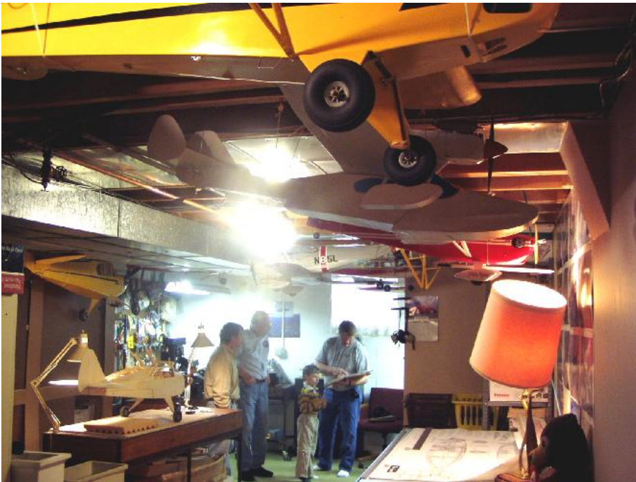
Morgan Larson's workshop was the latest on the tour schedule.

This is a “last call” for volunteers to help out with the field mowing chores this year. Our manicured flying field is made possible only through the efforts of a dedicated mowing crew that takes turns at maintaining the portion of our total land area that we use for flying. The club owns two well-maintained tractors that are actually fun to operate. If you're a new volunteer, we'll show you how to operate them safely at the Field Cleanup Day, currently scheduled for May 5th. The mowing schedule will be posted on the website some time during the month of April. The schedule runs from May through early October. If you missed the opportunity to add your name to the signup sheet at the March meeting, contact me directly at president@tcrconline.com to have your name added to the list. It would be great to be able to add a few additional names to the mowing crew roster this year.