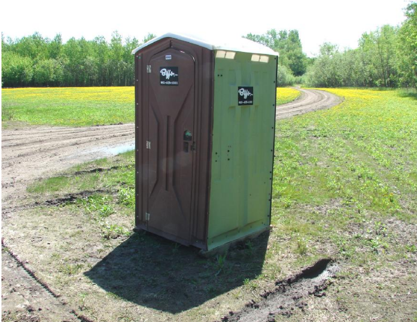
The Biffy's at the field and ready for business.

Be At The TCRC Invitational Fun Fly on Saturday, June 16th