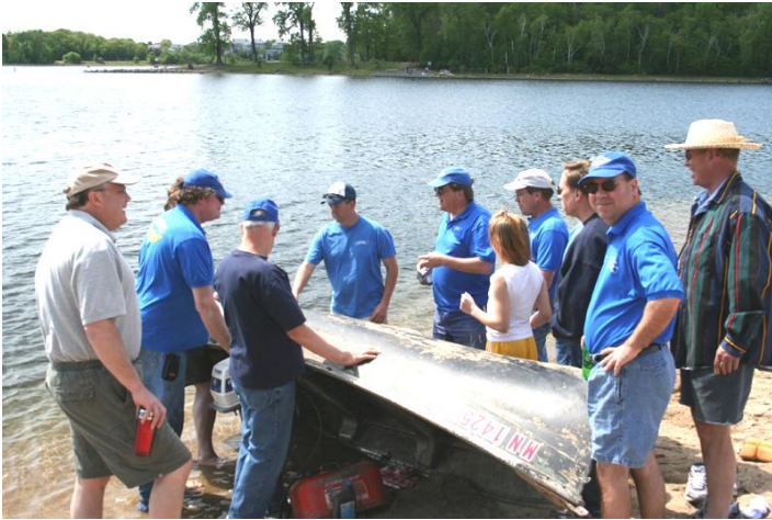
There were plenty of hands to help come up with a patch for the retrieval boat.