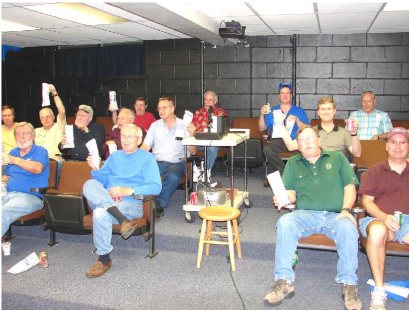
Movies at the May meeting.