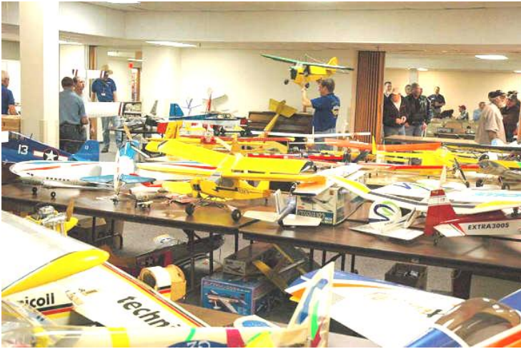
The impound area was crammed with planes of all types and sizes.