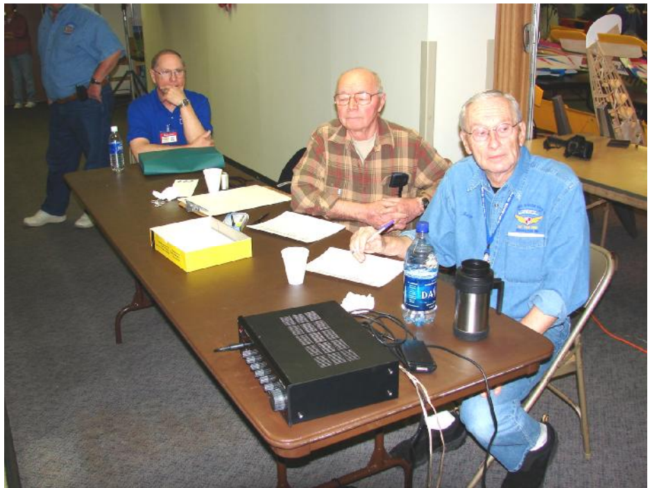
The recording crew wasn't daunted by the fast action at the TCRC auction.