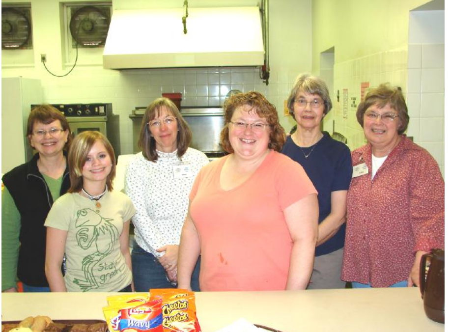
This was just one shift of the hardworking concession crew at the auction.