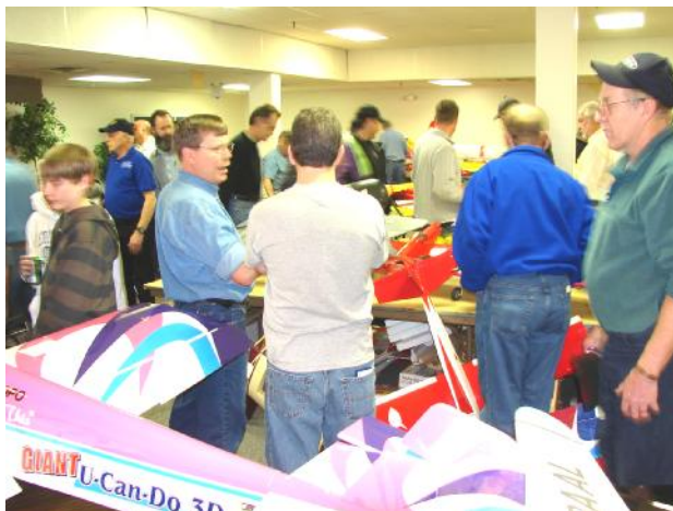
Buyers check out the planes in the impound area.