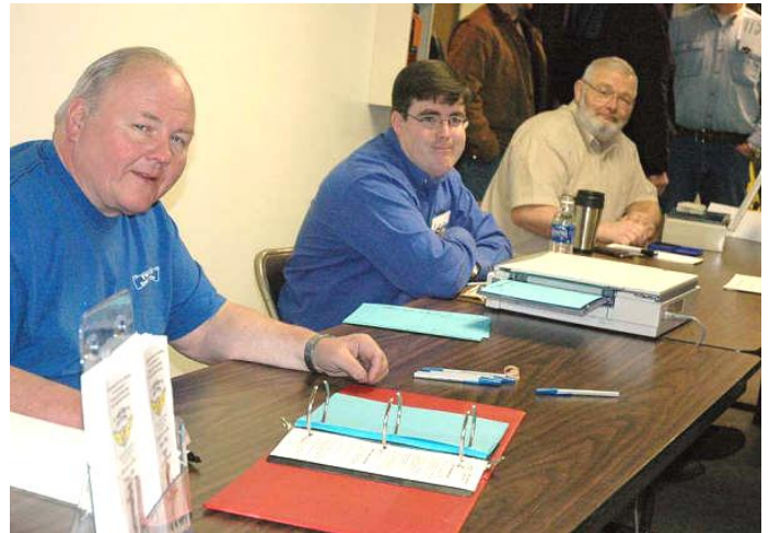
The bidder check-in crew was a well-oiled machine all during the auction.