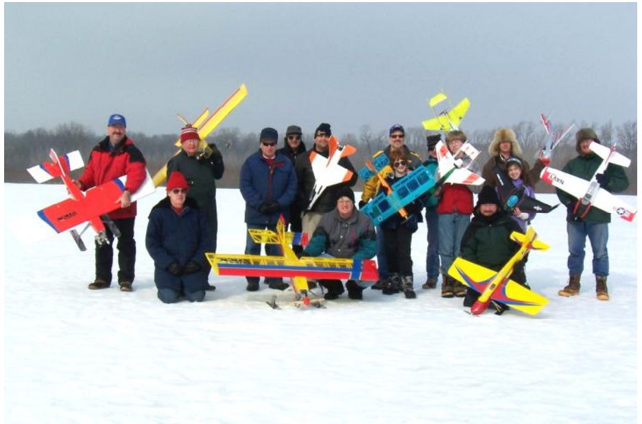
Cool air didn't stop these intrepid flyers as they added their second month to their 2008 ASF patch.

Saturday, February 2 nd started off overcast but the sun came out a little later to welcome all of the All Season Flyers who came to enjoy the day.