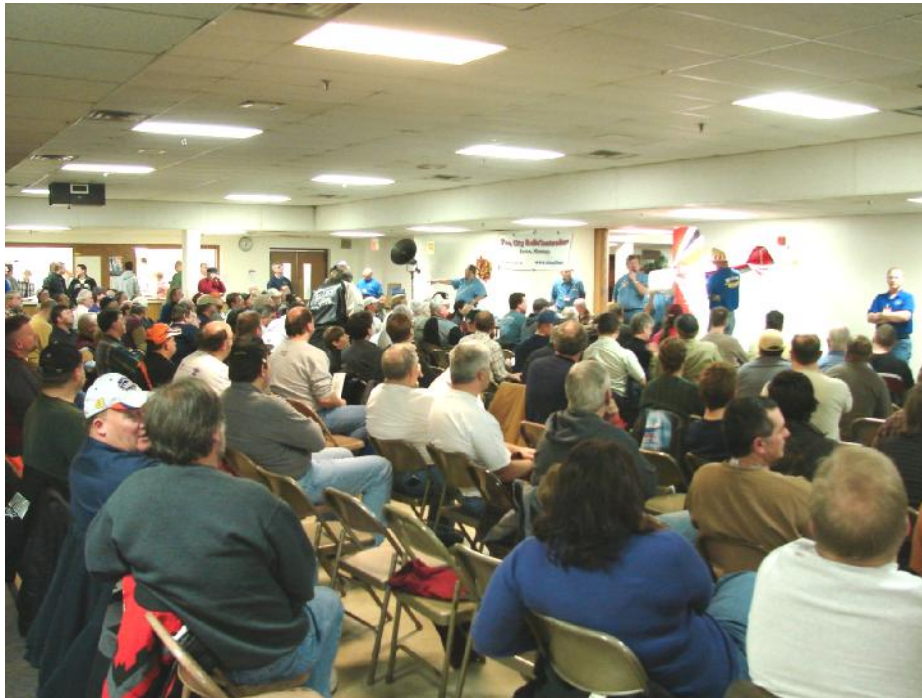
The crowd settled in for a long day at the 32 nd Annual TCRC Auction.

The 32 nd Annual TCRC Auction is now history, and record-setting history at that!