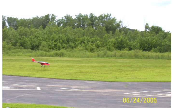
Tim Johnson's turbine-powered plane makes a nice landing approach.