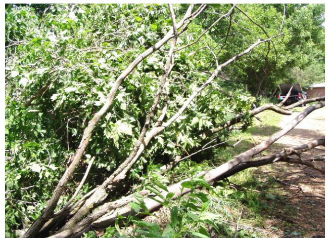
The last three vehicles to leave the Fly-In got blocked by a tree taken down by the high wind.