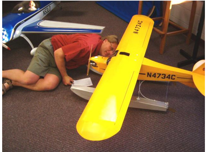
What would a building contest be without at least one J-3 Cub?