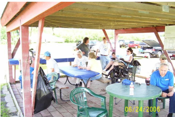
Pilots and spectators relaxed in the shelter between flights.