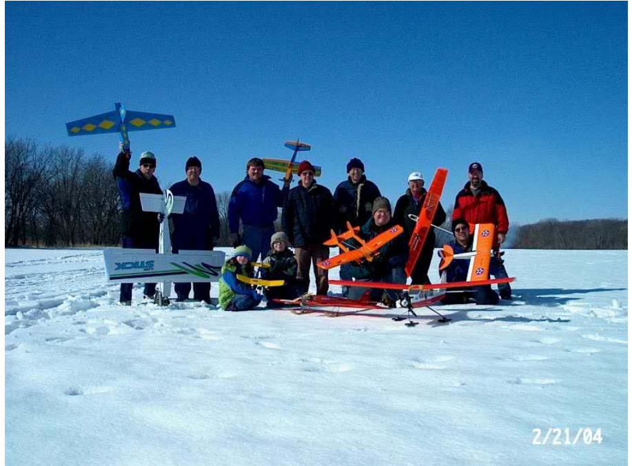
Most of the group at the February ASF event took the time for a quick picture before getting back into the air.