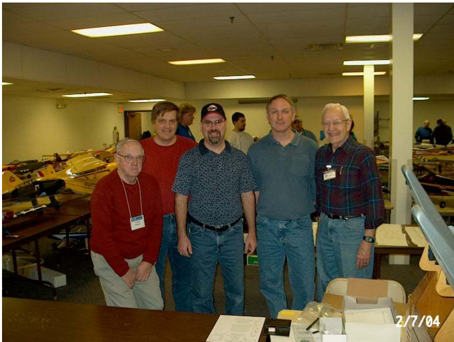
Just a few of the workers in the impound area at the 2004 auction.

By all counts, the annual TCRC Auction was a great success! Overall revenues were on a par with last year, but with a few surprising changes in the revenue allocations. Thanks again to all the volunteers that came out and made this annual event such a success this year. We couldn't do it without you.