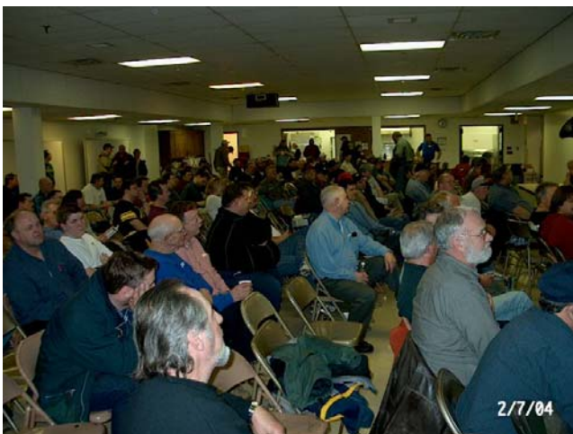
Some of the crowd at the auction.