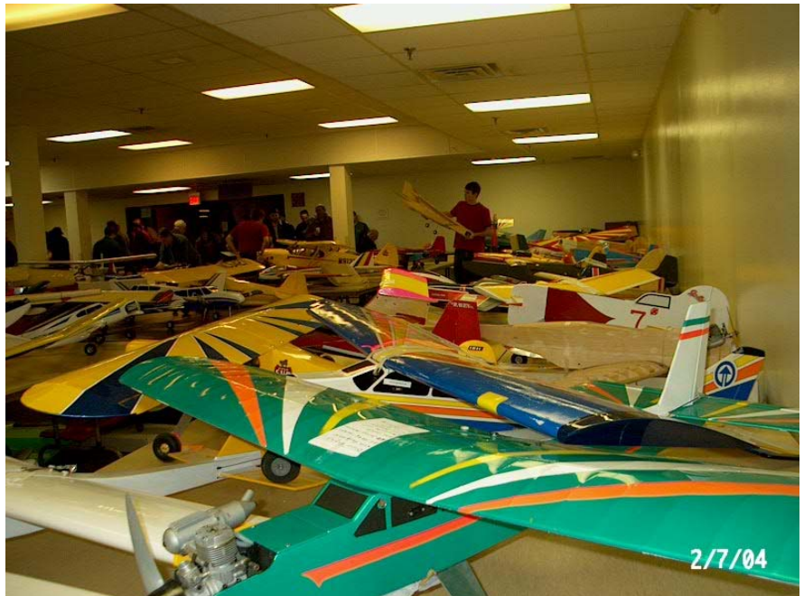
The impound area was full from one end to the other with every kind of R/C airplane imaginable.