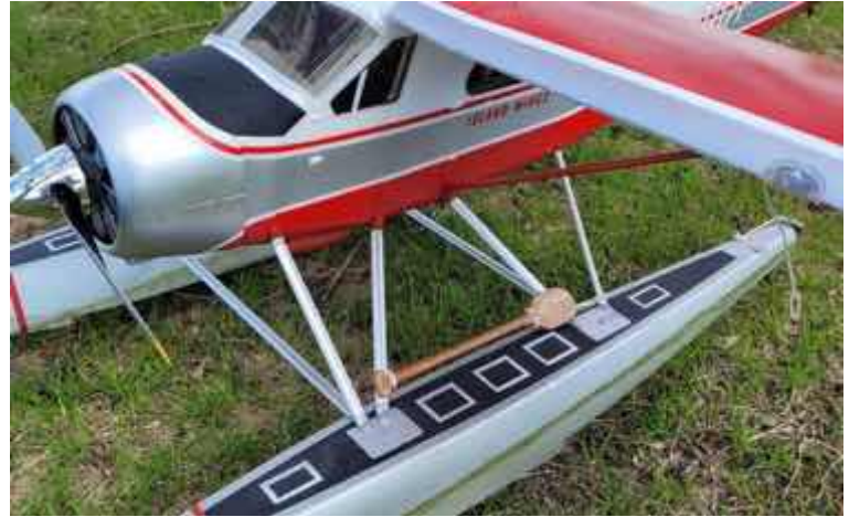
Mark Wolf's Beaver came prepared with added paddle if needed to get the plane back to shore.