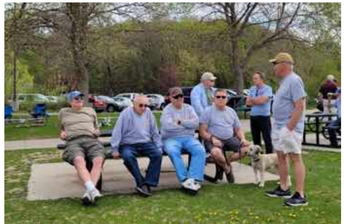
If the pilots were flying their airplanes, they were talking about them.