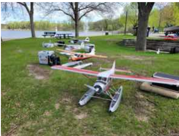
There were lots of neat looking airplanes in the pits for all to enjoy at the Spring Float Fly.