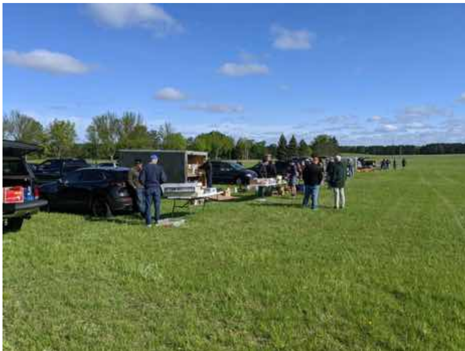
The vendors lined up along the edge of the runway at the Scott County Fairgrounds.

With the TCRC Auction being held in April and only a few weeks after, the swap meet was not as large as last year. There were about 50 people in attendance with 18 people/vendors selling their items. Members showed up from other clubs and some traveled from 200 miles away.