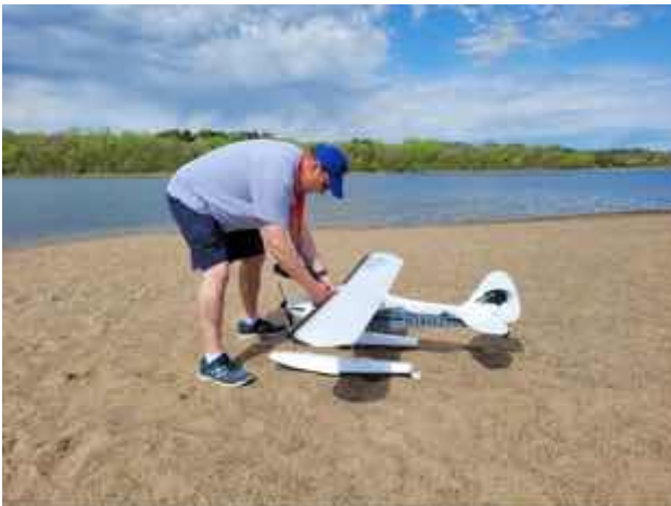
A last minute tweak or two for the Cub before it took to the skies for another flight.