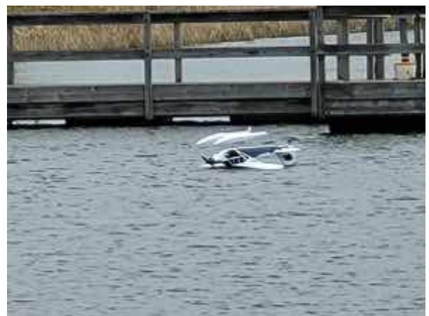
Another hard maneuver to master at the Spring Float Fly was the inverted taxi.