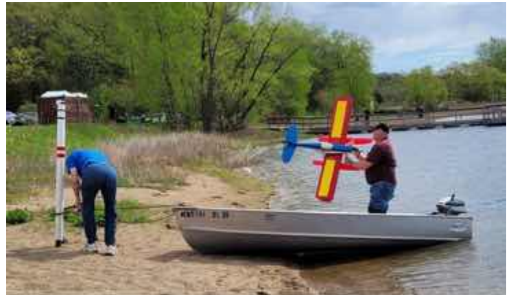
With the wind creating some currents and gusts, Tim Young's retrieval boat got a little work out rescuing planes that didn't make it back to shore.