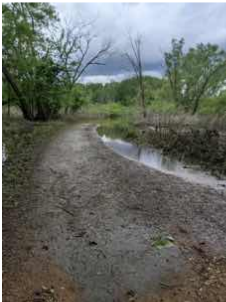
Water on the edge of the road heading to the field.

TCRC's Jordan Flying Field is currently underwater, caused by the heavy rains that have occurred to the west in the Minnesota River basin.