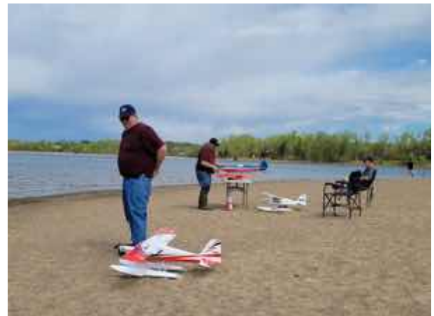
Bush Lake Park is an ideal venue for TCRC's Float Fly with a great sandy peninsula.