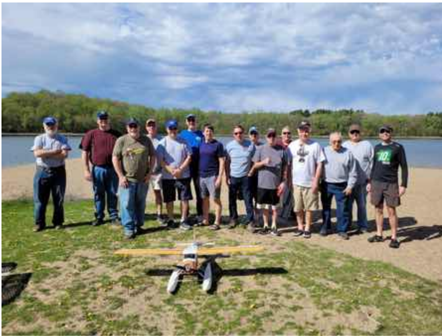
All of the pilots at the TCRC Spring Float Fly were eager to fly.

Arriving at Bush Lake shortly after 9:00 am I was greeted by several pilots. While waiting for the retrieval boat they were debating how to fly in a breeze coming from the west. Bush Lake beach is a peninsula so we would be landing along the south side of the peninsula. After the boat arrived, we had a quick pilots' meeting about the rules of flying at the lake. The local weather report hinted that the wind would increase after lunch, so I encouraged the pilots to take advantage of the current conditions and get flying.