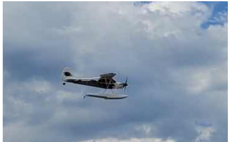
The float planes in the air entertained the spectators at Bush Lake Park.