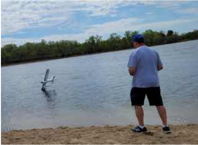
The performance of a knife-edge at water level really takes a steady hand on the sticks!