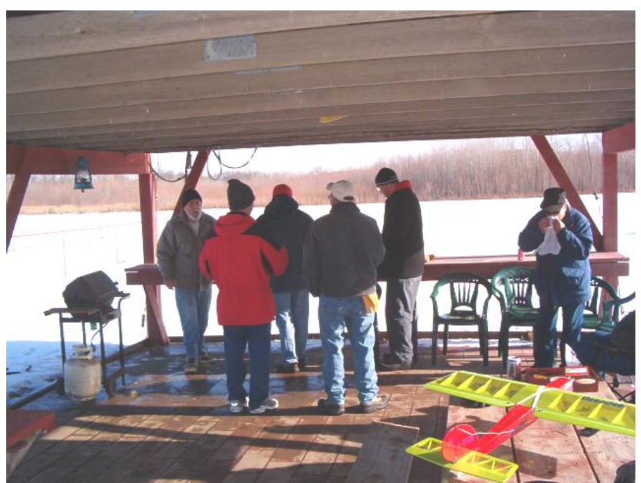
The grill was hot and there was plenty of food for those pilots that worked up an appetite while flying.