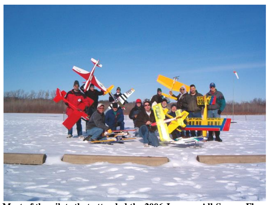
Most of the pilots that attended the 2006 January All-Season Flyer kick-off.

For the first time in three weeks on January 7<sup>th</sup>, TCRC'ers saw the sun. And they saw it at the Jordan Field for the 2006 All-Season-Flyer kick-off.