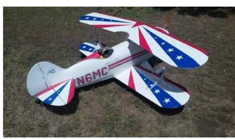
1/3-scale Pitts S2 with DLE111 engine and with smoke.

I am making available for sale the five gas-powered models shown below: