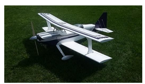
<sup>1</sup>/<sub>4</sub>-scale Ultimate Bipe with DLE 55 engine.