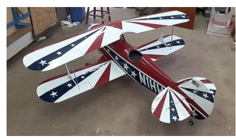
<sup>1</sup>/<sub>4</sub>-scale Skybolt with DLE 55 engine and with smoke.