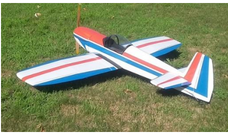
<sup>1</sup>/<sub>4</sub>-scale CAP 20L with DLE 55 engine.